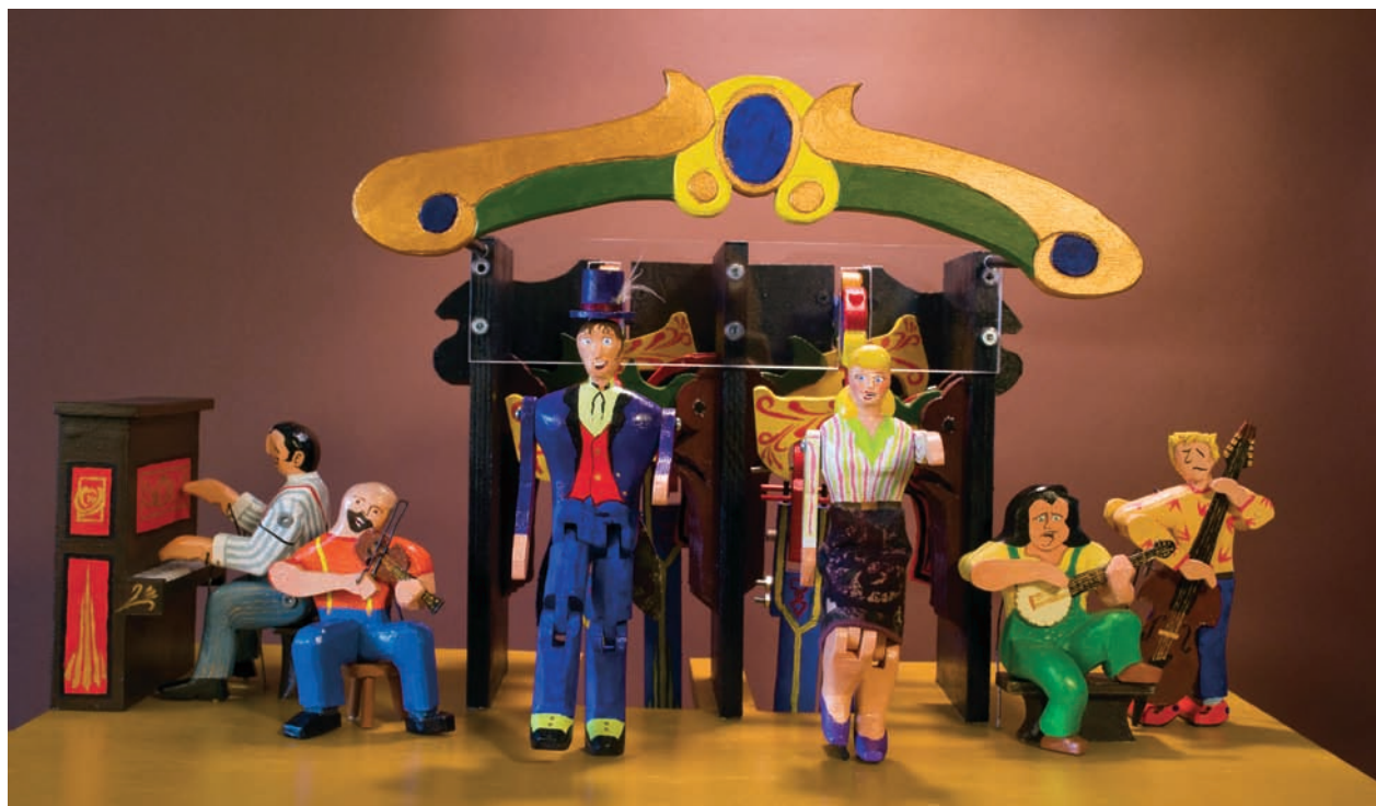
Jessica FIELD, The Musicians , 2011. Wood, metal and plastic. 60 x 90 x 45. Photo: courtesy the artist.

→ Jessica FIELD, Field Studies: Protozoan Flagellates , 2009. Solar panels, electronics, and metal. Photo: courtesy the artist.