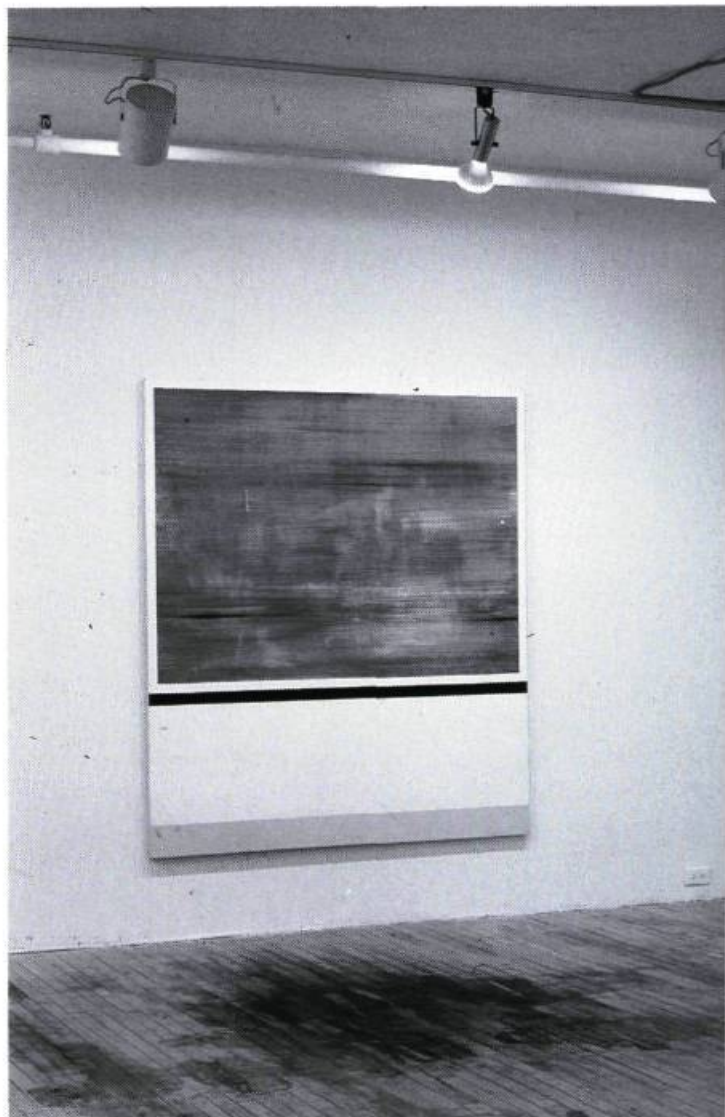
Michel Daigneault, Abstraire l'Abstrait , 1993. Acrylique sur toile. À gauche

eighteenth century. The main galleries of the museum were set up as a series of visual sequences that can generally be described in three groups. The first group concentrated on the work of Piranesi teachers and predecessors; the second included a large body of Piranesi etchings, drawings and watercolours; and a third grouping formed a survey of contributions by artists and architects directly influenced by the genius of the Venetian architect.