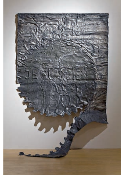
David Moore, Réplique cacophonique . 2009. Plomb. 900 x 280 cm.