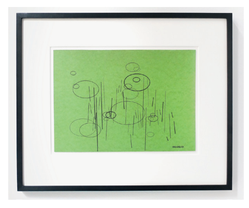
Aesthetica, Frieder Nake, 7.4.65 Nr. 1+6, 1965. Ink on paper. Zuse Graphomat Z 64.

ings, and bringing an original Zuse machine to the gallery, speaks of the intention to give the early works a proper environment that highlights their historical value and moves away from the more flashy and superficial aspects of media art, which, as Sommerer and Mignonneau state, is "an ephemeral field that is obsessed with novelty and change."<sup>14</sup> DAM is probably the only gallery that could set up an exhibition like Aesthetica , given Wolf Lieser's expertise and outstanding support of the pioneers of computer art. Lieser has stated that it was precisely the lack of