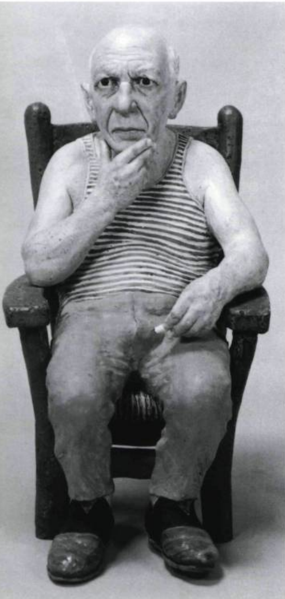
Joe Fafard, My Picasso , 1981. Clay, glazed and painted. 46.1 x 26.3 x 33.5 cm. Collection of the artist.