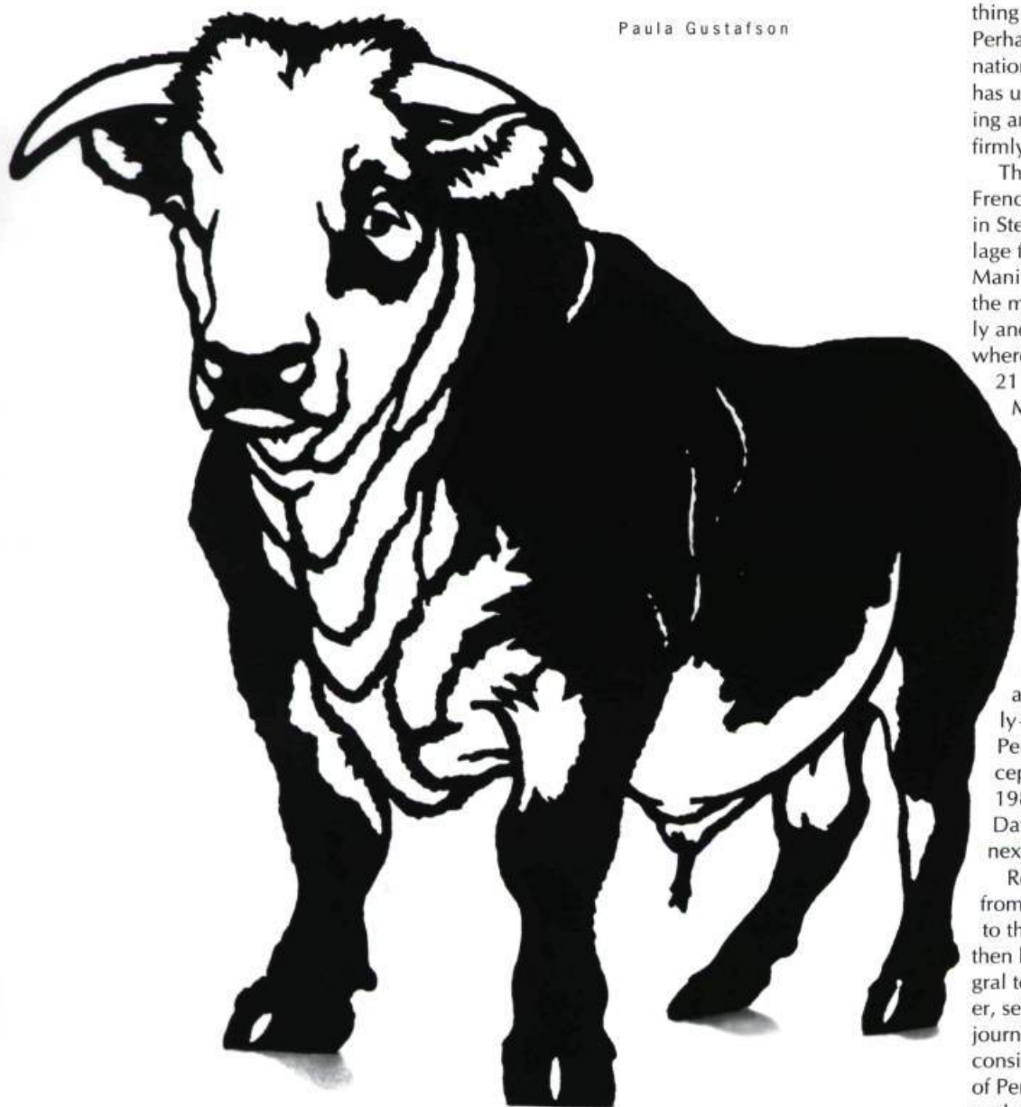
Joe Fafard, Sam I , 1993. Stainless steel, painted, 7/10, 13.7 x 13 cm. Collection of the artist.

O n the Prairies, cows are ubiquitous reference points. In a flattened landscape punctuated only by occasional bursts of trees, the slow-moving figures of cows serve as landmarks; something to look at, something to measure against sky and horizon. Perhaps that's why, again and again, internationally acclaimed sculptor Joe Fafard has used cows as both a method for working and metaphor that keeps his imagery firmly planted on familiar terrain.