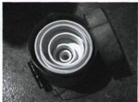
PANYA CLARK ESPINAL, The Facilitator , 2003. Metal butter bucket, wood, latex paint. 19.3 x 17.2 cm. Diameter.