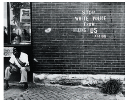
← What Does Democracy Look Like? , installation view, Museum of Contemporary Photography, Chicago, 2020.