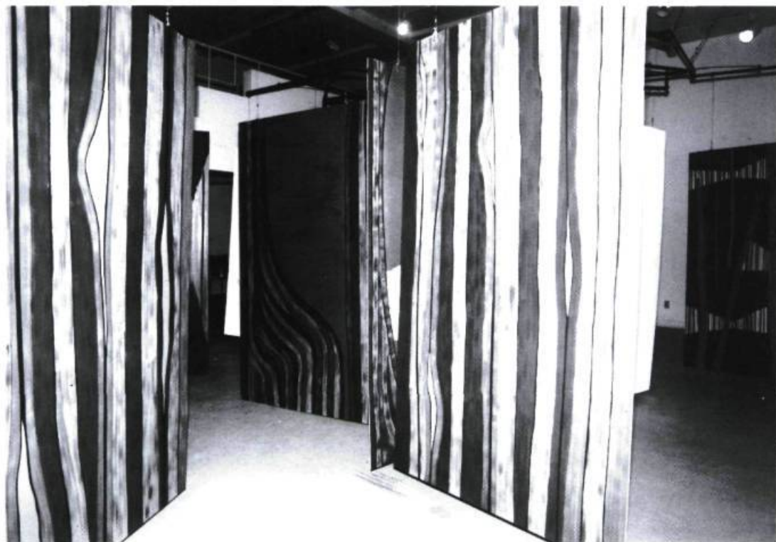
Joëlle Morosoli, Pièces/pièges , 1991. Wood, steel and motors; 8 x 8 x 7 m. Centre des arts contemporains du Québec à Montréal.

Joëlle Morosoli, Centre des arts contemporains du Québec à Montréal. From November 20 to December 19, 1991