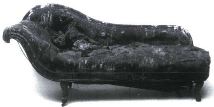
Bruce Conner, Couch , 1963. Cloth-covered couch with wood frame, cloth, paint. Norton Simon Museum, Pasadena, CA.

seeking kicks and love and satori, getting high on jazz and junk and booze and poetry.