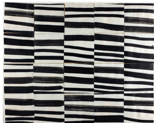
Ellsworth Kelly, Study for "Cit ": Brushstrokes Cut into Twenty Squares and Arranged by Chance , 1951. The Art Institute of Chicago.