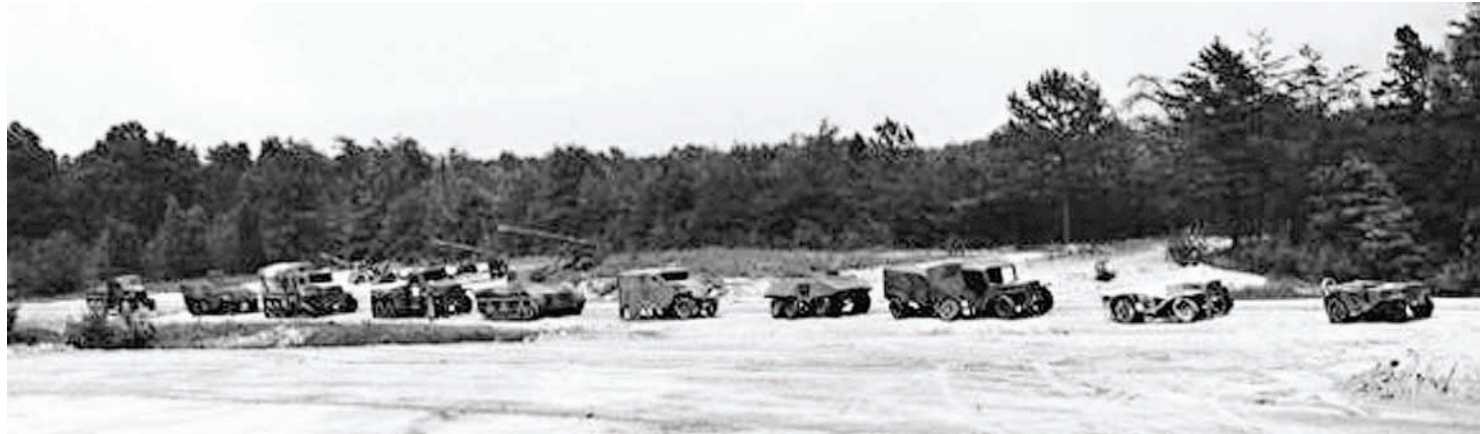
Convoy of armoured vehicles and tanks made of rubber by the Ghost Army.

which have long historical lineages and which often share musical structures, narrative interests, and socio-political affiliations to musical genres from other countries. Thus for the Country genre we could think about the relations it shares with traditional storytelling songs such as European Sea Shanties from the 19 th century, or Mariachi music from Mexico. Meanwhile, for the Rap genre we can think back to its West African traditional oratory roots in the songs and poems played by musicians known as Griots; or laterally conceive of the associations and relations of resistance it holds as an art form with the Afro-Brazilian form of music, martial arts and dance known as Capoeira, to realise that the lineages of these genres of music have long lasting and easily identifiable connections to global forms of musical organisation and politicisation.