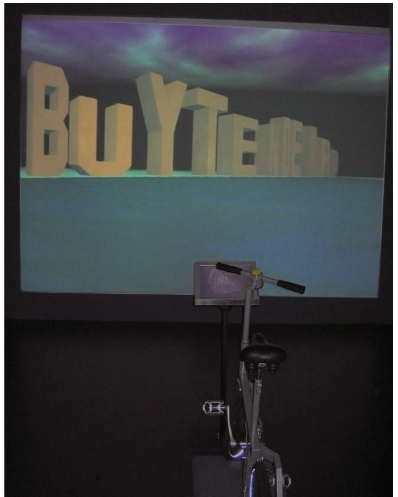
Jeffrey Shaw, The Legible City , 1990. Exhibition Digital Avantgarde/Prix Selection . Lentos Kunstmuseum Linz, 2004.