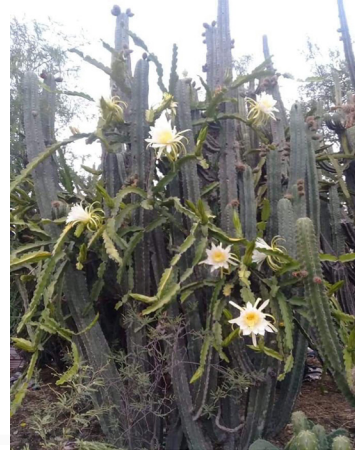
Figure 3. Rhizome Model of Development.

as pitaya , pitahaya , mezquite , guaje , or kalanka (see Figure 3). The pitaya recalls the image of a rhizome, different roots connected to one another for the benefit of all, including other species, such as the kalanka (Mexican chrysactinia), that live beneath its roots. In the Nguigua culture, reciprocity entails collaboration, respect, and well-being.