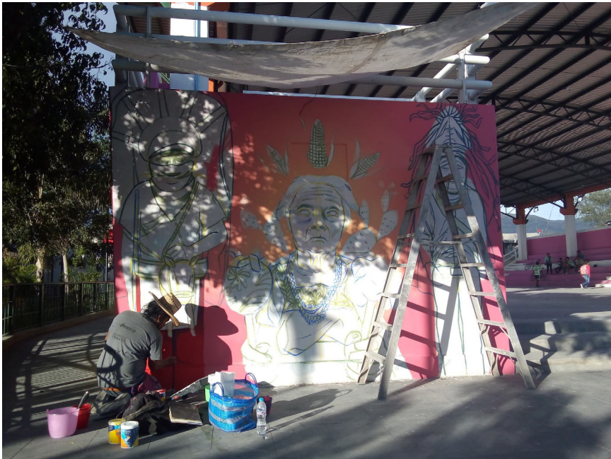
Figure 5. Ngigua Dancing Mural. Photo by López Varela, September 2019.

This dance includes the participation of girls and only one boy...the king. They use long dresses, naguas , with two or three laced frills, including long red skirts, a red necklace, a red handkerchief, and a red ribbon on top of their head. They also use feathers and a rattle; they either wear guaraches [sandals] or they dance with their barefoot. Las tocotinas danced to the beat of the violin, they humble themselves towards the deity; they dance in circles moving back and forth the rattle and the feathers. At the end, they kneel before the king and the queen. (Eligio Juárez personal communication, September 27, 2019)