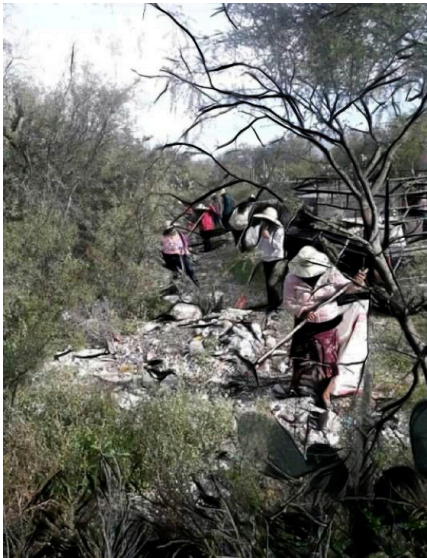
Figure 4. Cleaning the jagüey at San Marcos Tlacoyalco. Photo by Lucas Jaime, March 2021. Used with permission.

We [community members] organize ourselves in committees which work in three different areas: the Catholic Church, water treatment plant, and drinking water reservoir. We meet every Sunday and follow the decisions proposed by the assembly for each neighborhood linked by committees. Each one represented 6 to 7 families, and each neighborhood included 60 to 70 people. Neighborhoods work around our agreements, which we reach during assembly meeting. The day of their collaboration [e.g., cleaning the jagüey ] they [the assigned neighborhood] participate without restrictions. (Interview with Lucas Jaime 2020)