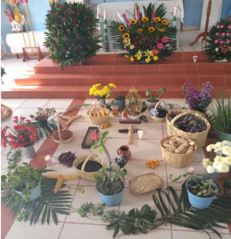
Figure 7. Baskets of Solidarity Feast. Photo by Karla Cruz, November 2020. Used with permission.

During the days known as thi tenkininxinisincheeni (the promise), there are multiple acts of gratitude shared among community members who organize the feast. Most of the families who belong to a neighborhood participate in the organization of the feast and contribute food as a gift for the rest of the families who attend the festivity. These are called “baskets of solidarity” (see Figure 7).