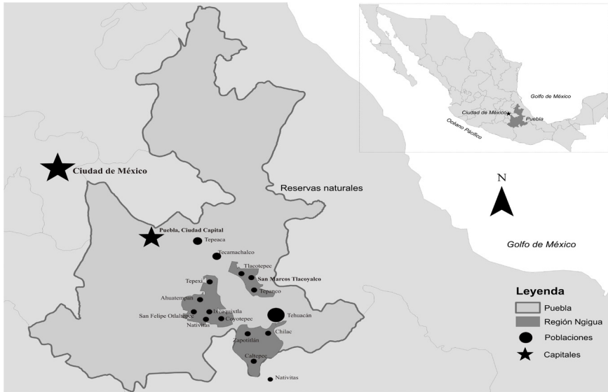
Figure 1. Nguigua Region.

This paper reports the preliminary results of our research conducted in San Marcos Tlacoyalco. We employ data collected over a twelve-month period from September 2019 through 2020, including 6 months of fieldwork, one-on-one and online semi-structured interviews, and face-to-face informal conversations. Due to the COVID-19 pandemic, we conducted the last six months of our project at a distance through WhatsApp, Zoom, and Skype. López Varela spent six months (September 2019-February 2020) conducting fieldwork and interviewing key participants about their experiences and constructions on Indigenous governance. Manzano-Munguía conducted online interviews among Indigenous leaders (see Figure 2).