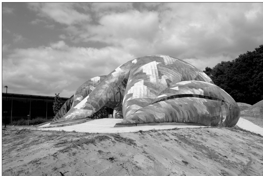
Fig.1: Son-O-House does not contain a single straight line. Paper model 2004.

in collaborating with Spuybroek was “to get rid of the distinction between architecture and sound.” 14 This called for a spatial interpretation of sound, by which it could act on the same plane as architecture. In order to make the sounds in Son-O-House into a spatial composition, they are not based on identical repetition but rather on internal difference, that is, on constant variation and development. This process is constituted through interactivity. The Son-O-House is divided into five sound fields which each have four loudspeakers. Throughout the building twenty-four sensors are placed at different heights and in different positions.