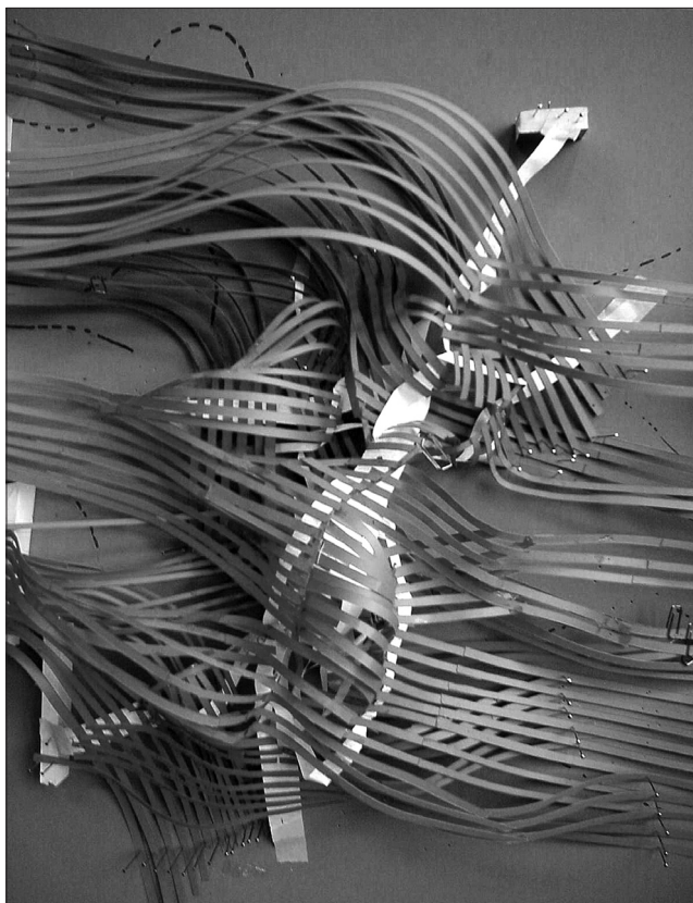
Fig. 2: Paper strips form a complex structure of bent arches, generated by the material itself. Picture of model Son-O-House 2004.

more movement, this can be understood as the result of sound transition. In such a case, the system stores the sounds for possible future re-use. A double-sided interactive process is thus at work: by their movements visitors leave traces in the continuously changing composition of Son-O-House , while at the same time the system learns which sounds are most effective in triggering and influencing human movement. It is important to note that the musical interaction is indirect: a visitor does not drastically alter the featured sounds, nor will she easily perceive the influence she has. Instead, the overall sound composition gradually changes due to human movements. Son-O-House builds on the generative difference between sound and architecture, allowing both media to meet through spatial connections. Mark Hansen's analysis of Son-O-House astutely points out that the musical and architectural interaction both define space through movement, in