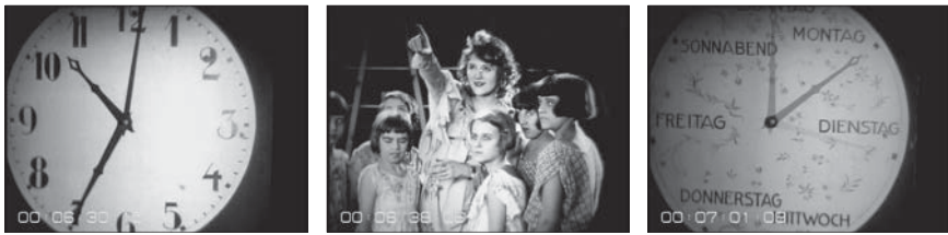
Fig. 4 a, b, c: Plant Temporality: “Let the clock race!” Das Blumenwunder.