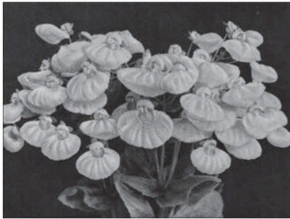
Fig. 1: Slipper Flower. Das Blumenwunder Souvenir Program (Private Collection).