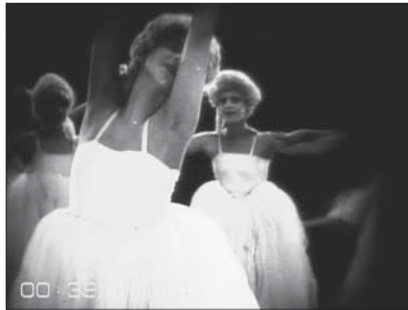
Fig. 7: Berlin Ballet Corps. Das Blumenwunder.

Here we should recall that during the Weimar period, Ausdruckstanz , also called “expressionist,” “interpretive,” “absolute” or “ecstatic” dance, was an experimental dance form which aimed to “project deeper levels of the human psyche,” 47 but also chart out the “ugliness” and distorted rhythms of modern life.