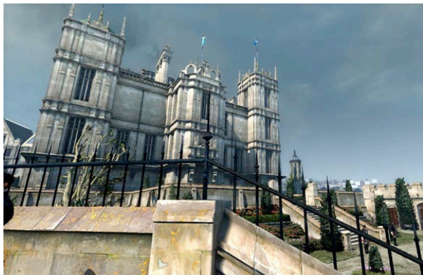
Figure 7 - Dunwall Tower in the opening prologue of the game. The player is unable to progress past the steel fence, but is allowed to explore a small area outside.