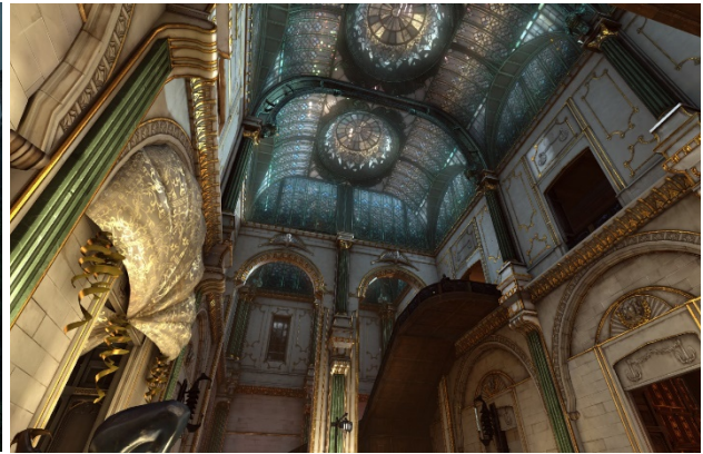
Figure 10 - The intricate Renaissance-styled architectural detailing within the decadent Boyle mansion