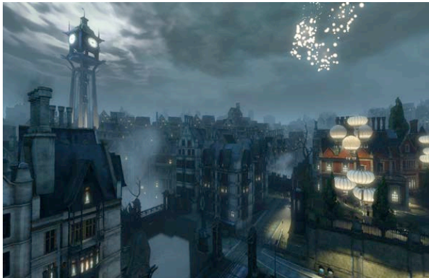
Figure 11 - A view from the rooftop of a building in the estate district. Despite civil unrest and plague, the upper class still manages to enjoy the exuberance of a masquerade ball within the fortified walls of the Boyle estate.