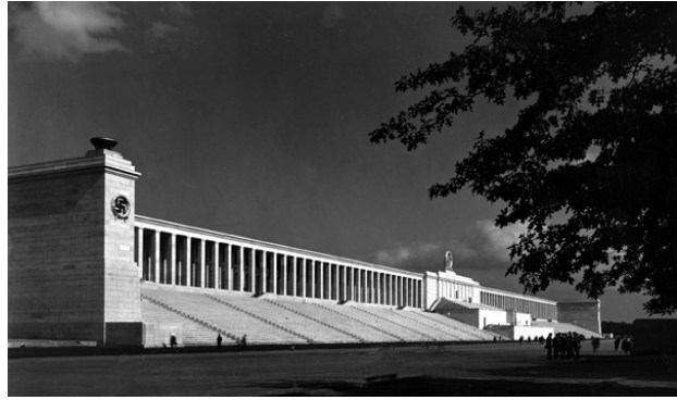
Figure 2 - The Zeppelin Grandstand, designed by Albert Speer, a part of the Nuremburg Rally