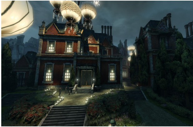
Figure 9 - The exterior Facade of the Boyle Mansion