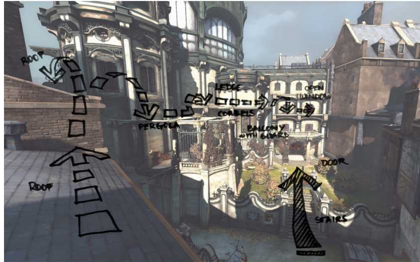
Figure 15 - A sketch showing two potential pathways into one of the buildings Corvo must infiltrate. A stealthy approach shown in dashed arrows requires the player to consider and be aware of architectural features far more than the confrontational approach shown in a solid arrow.

facilitated alternative pathways to the goal which were unseen by patrolling enemies. For instance, the horizontal lines in the architecture of the Office of the High Overseer played a functional as well as intertextual role in the game as they afford Corvo the means to scale and traverse the building with ease, unlike the unreachable ceiling spaces of Coldridge Prison and its uninterrupted vertical. In this way, the architecture in this first assassination mission works to ensure the player feels as though they have overcome the helplessness that they experienced in the prison. When playing in high Chaos, however, play was typically characterized by simply charging down the middle of an area killing everyone in the path, while paying little to no attention to the surrounding environment or architecture (this playthrough also took significantly less time to complete).