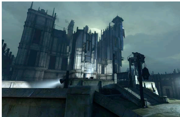
Figure 8 - Dunwall Tower following Hiram Burrows' rise to power. The lighting serves to emphasise the building's menacing visage.