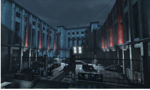
Figure 1 - The Office of the High Overseer