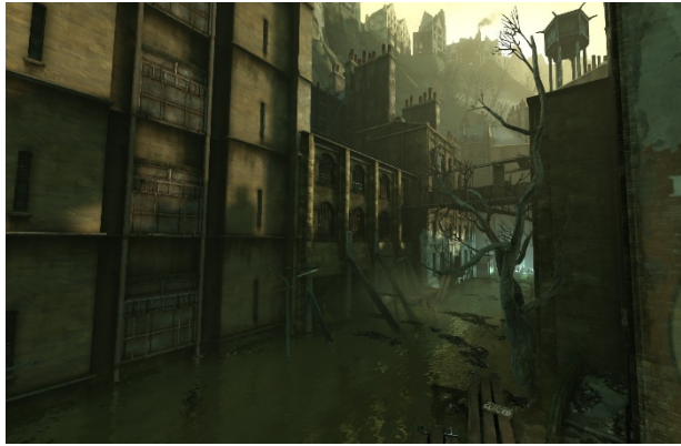
Figure 13 - Submerged warehouses and refineries litter the Rudshore Waterfront in the Flooded District, inhabited only by hostile river creatures and infected plague victims.