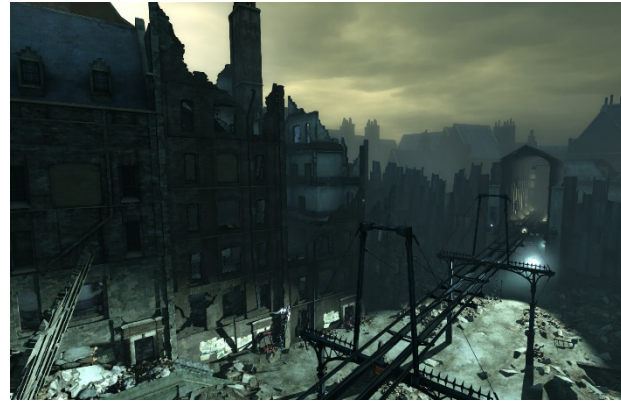
Figure 14 - Ruins in the condemned Flooded District, where very few survivors hide from the City Watch. The train tracks are used to transport and dump the bodies of plague victims.

choices. In low chaos, the ending shows Emily Kaldwin rising to the throne as a benevolent and loved ruler, bringing the city of Dunwall back from the brink of destruction into a golden age as a cure for the rat plague is developed. Conversely in high chaos, Emily will either begin a sadistic reign of terror influenced by Corvo's violent actions or be absent completely if she died in the final mission. In this case the ending shows the rest of Dunwall being decimated by the plague as Corvo flees the city on an outbound ship. The horrors of the plague experienced in the Flooded District provoke moral reflections on the consequences and influence of the player's actions. Fraser (2015) notes that "the dimension of exploration is one way in which the visual or surface content of ruins-in-games moves beyond the symbolic to shape activities that may impact or facilitate gameplay" (p.26); in this instance, we argue that it impacts the player's role as an ethical agent. Architecture in Dishonored works to shape the player's ethical agency through their interactions and observations in Dunwall by providing motivation (or deterrence, depending on their moral code) to redeem the city and save the lives of the citizens of Dunwall.