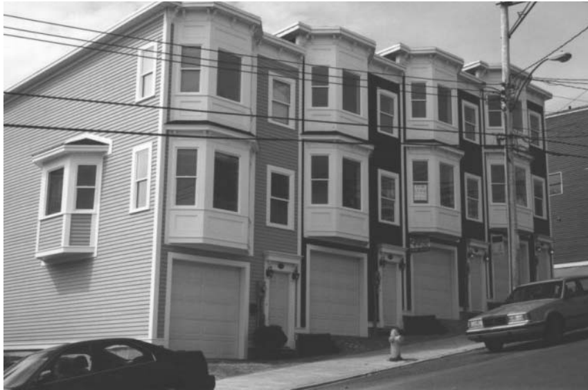
Figure 10. Private infill development on Prescott Street.