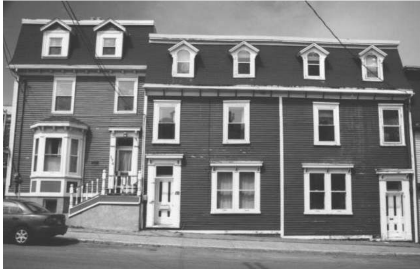
Figure 2. Gower Street houses restored by the SJHF.

The character of the traditional streetscape is thus defined by the repetition of a few basic structural and decorative elements: narrow clapboard, vertical windows, wide trim, eave and window brackets and, although the feasibility study did not make a point of it, mansard roofs on some streets (Figure 3). One of the major shortcomings in the City's heritage legislation is the failure to describe these traits, and embed the requirement that they be preserved in the development control legislation. The 'heritage' streetscapes of St. John's were thus left vulnerable to incompatible alterations. This is not an uncommon situation. In the Old Strathcona HCA in Edmonton, no authentic details requiring preservation were specified. The inevitable result was that "generic old-fashioned" features providing only "hints and references" to the past rapidly appeared on both old and new buildings (K. Wall, 2002: 32). Even Ottawa, with its 11 heritage districts, has strangely limited municipal oversight, since only those changes requiring a construction permit are monitored, leaving roofing and siding materials uncontrolled (Tunbridge, 2000: 281).