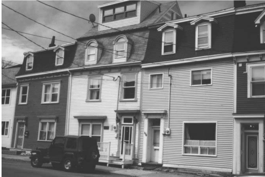
Figure 6. The discordant effect of inappropriate alterations on Gower Street.

provision allowing them to be used as bed and breakfast houses, or condominium units, in order to generate the additional income necessary to maintain them.