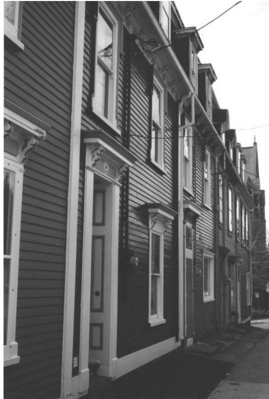
Figure 3. The repetition of basic facade elements gives symmetry to Gower Street.

West End residential neighbourhoods that contain significant groupings of architecturally interesting older buildings that help to form ‘heritage streetscapes’” (City of St. John’s, 1989: 8) and now covered 167 hectares (413 acres). Freeing the heritage area concept from its erstwhile strictly downtown location, the 1990 expansion represented a major departure from the original concept, and the nearly four-fold increase in the area increased the number of properties within the HCA from approximately 600 to nearly 2,100 (Figure 4). The expansion was cleverly effected by proposing extensions of the original area in three separate local Planning Area Development Schemes. This strategy of piecemeal expansion, while effective in allowing the planners to accomplish what they intended, precluded a public debate on the fundamental question of whether the size of the HCA should be increased. The pragmatic benefits of this strategy are obvious, especially in a city where public support for the very idea of heritage conservation is fickle and muted.