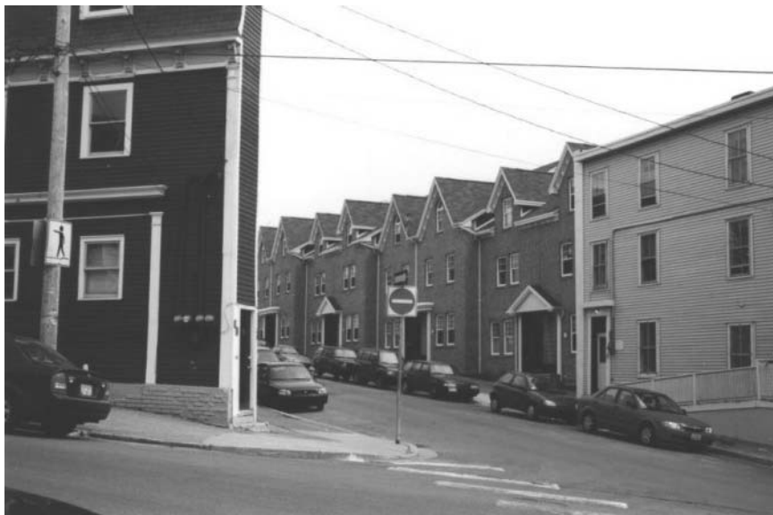
Figure 9. Brittany Terrace.