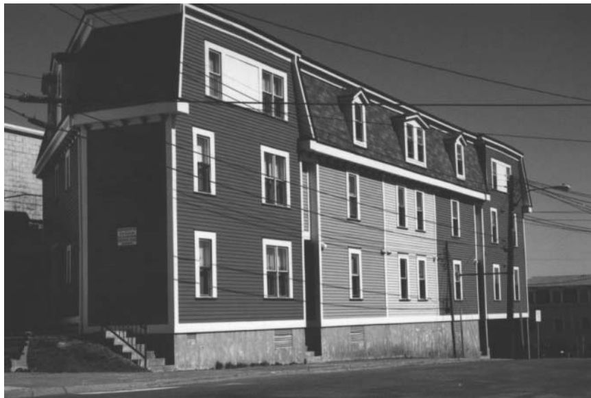
Figure 7. Municipal Infill Housing on New Gower Street.

The second type of damage has resulted from contextually inappropriate infill development. This was not always a problem. During the 1980s the City’s non-profit housing agency made effective use of the municipal non-profit provisions of the National Housing Act to create some innovative residential infill developments in the downtown. It was joined by Central Mortgage and Housing Corporation, and the Newfoundland and Labrador Housing Corporation, which also took the time and spent the money to ‘get it right’ by engaging the services of architects with a proven track record of sympathetic design in heritage areas (Figure 7). Alas, the days of such contextually appropriate development are long gone. Several new developments reflect only the Disneyfied version of heritage conjured up by developers who think that ‘heritage’ and ‘quaint’ are synonyms for a generic North American style of downtown architecture. Consider but two contemporary examples.