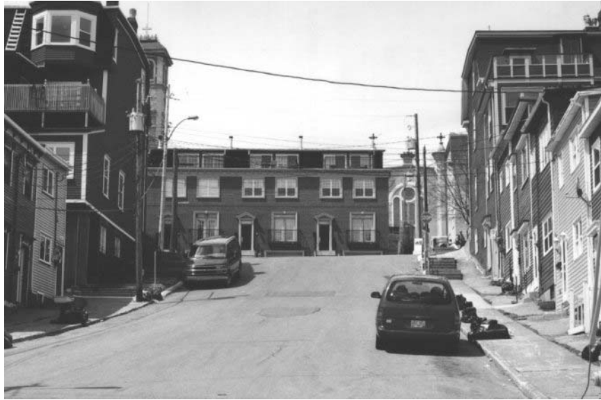
Figure 8. Looking north up Victoria Street to Dublin Row.