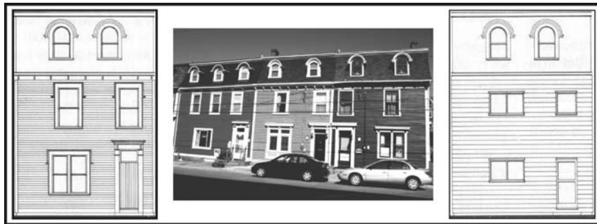
Figure 5. The facade of a traditional house (left), inappropriate renovations (right), and restored houses at 128-132 Gower Street.

The 1984 Municipal Plan required that all buildings in the residential precincts of the HCA “shall conform with other buildings ... originally constructed prior to January 1, 1930, in terms of style, materials , architectural detail and architectural scale” (emphasis added). Council’s 1991 design control policy required that “only materials and designs characteristic of the period up to 1914 or thereabouts be used for all repairs and rehabilitation of buildings in the Heritage Conservation Area.” However, when the Plan underwent a statutory review in 1994 the City proposed that the language be amended to require only that new development “conform with existing buildings in terms of style, scale and height.” This deprived the City of its authority to regulate the use of non-traditional materials on the grounds of aesthetic suitability, and thus to prevent inappropriate renovations (Figure 5).