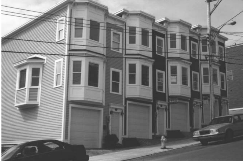
Figure 10. Private infill development on Prescott Street.