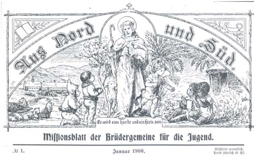
Cover nameplate of the Moravian children's magazine Aus Nord und Süd ; Unity Archives, Herrnhut.

served the Hebron Church. There he ministered when the devastating Spanish Influenza epidemic of 1918 ravaged the community. 2