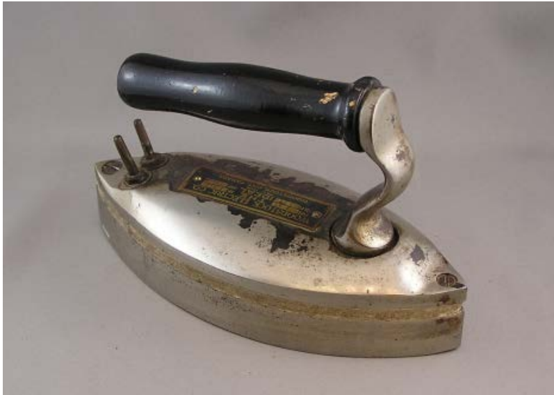
Figure 7: Woodstock Electric Company's 1908 Ideal EC Iron