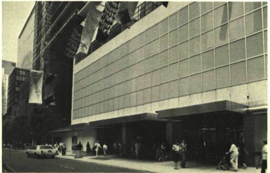
1. MUSEUM OF MODERN ART Front Entrance.