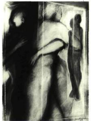
Dorothy Grostern Charcoal on paper