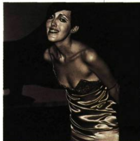
Arbus, Diane Girl with a shiny dress, N.Y.C., 1967 Gelatin silver print 50.6 x 40.6 cm