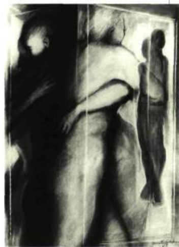
Dorothy Grostern Charcoal on paper