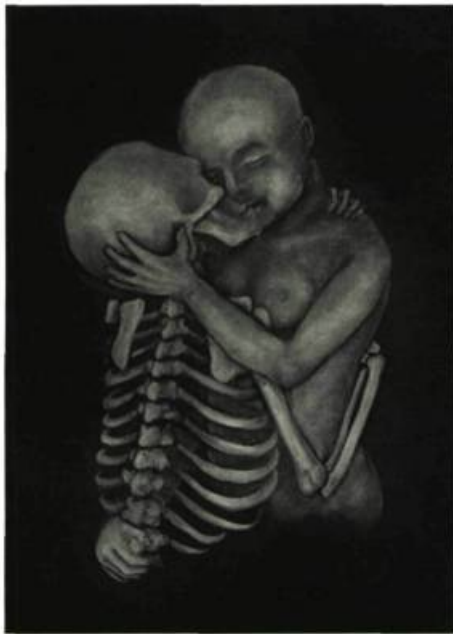
Catherine Heard Vanitas , 1999 Oil on masonite