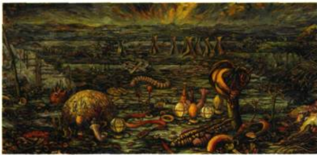
Jeffrey Burns, Conversions , 2000, oil and acrylic on canvas, 114.5 x 29 cm