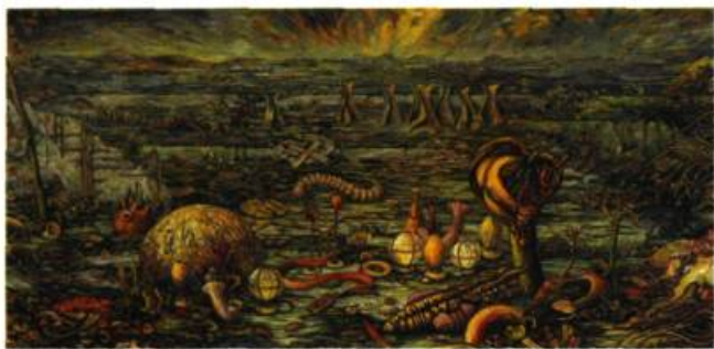
Jeffrey Burns, Conversions , 2000, oil and acrylic on canvas, 114.5 x 29 cm