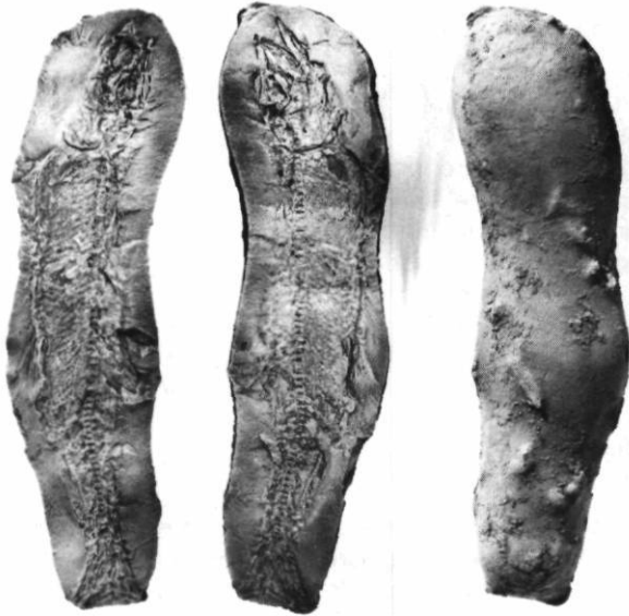
FIGURE 2. Green Creek concretion containing Mallotus villosus (ident. by C. R. Harington; National Museum specimen, NMC 36088). Dimensions of concretion: 14 cm long, 3.5 cm wide.

Mallotus villosus dans une concrétion du site de Green Creek (identifiée par C. R. Harington, échantillon du Musée national du Canada n° NMC 36088). Dimensions de la concrétion : 14 cm de longueur sur 3,5 cm de largeur.