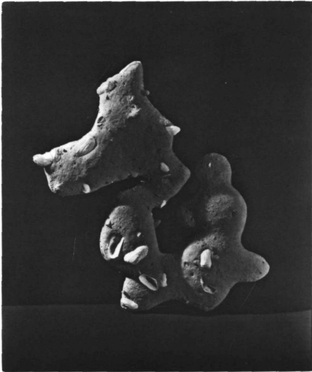
FIGURE 5. Large Green Creek concretions containing fossils and pebbles: 5a) Hiatella arctica and numerous granules of both Paleozoic and Precambrian rocks (max. dimensions of concretion: 12 cm wide, 18, 5 cm high; b) Hiatella arctica and numerous granules and pebbles. Large pebble of Precambrian granite gneiss, lower right, is approximately 3 cm in long diameter; maximum dimension of concretion: 22 cm wide, 18 cm high. Note: in figure 5a and 5b, the bedding