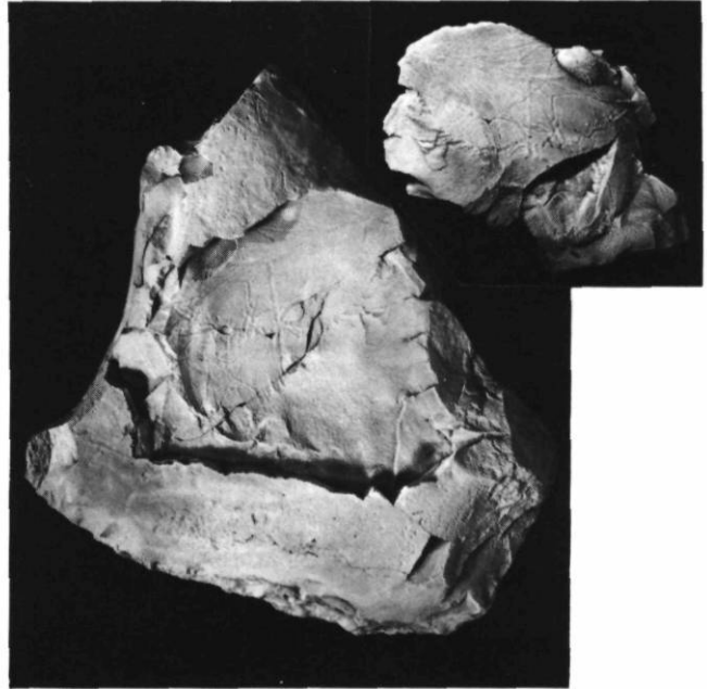
FIGURE 3. Green Creek concretion containing imprint of a feather (unident.), National Museum specimen, NMC 36089. Dimensions of concretion: 10 × 12 cm (larger part).

Impression de plume (non identifiée) dans une concrétion du site de Green Creek (échantillon du Musée national du Canada n° NMC 36089). Dimensions 10 × 12 cm (dans sa plus grande partie).