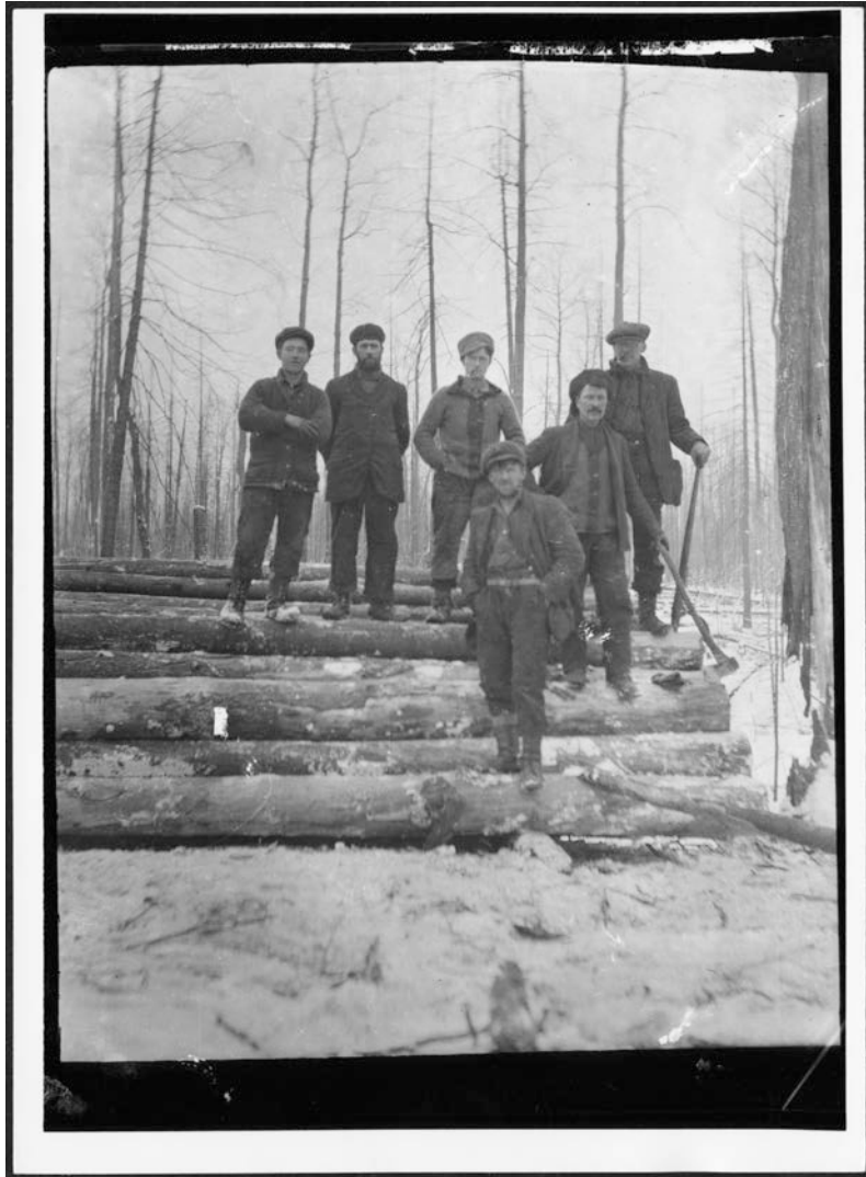
Figure 2. Men Posed on Logs, ca. 1914-1927.