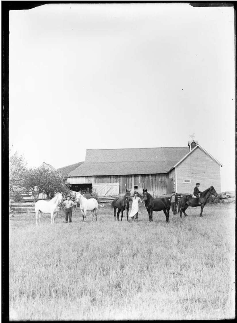
Figure 3. Men Posing with Horses in Front of a Barn, ca. 1895-1910