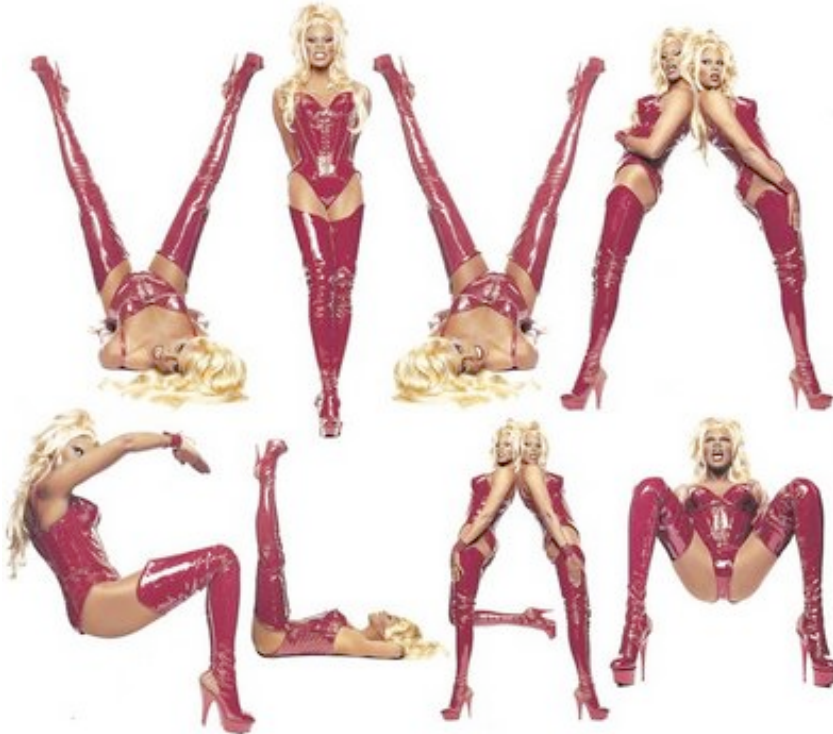
Source: www.macaidsfund.org/theglam/campaignhistory . Accessed December 11, 2013.

There appears to be no precedent in the cosmetics industry for a man (drag queen or otherwise) fronting a cosmetics advertising campaign targeted to women. 47 Contracts with prestige cosmetics brands were traditionally reserved for top models and, increasingly, celebrities. Frank Toskan, however, thought that RuPaul was a natural choice for MAC: