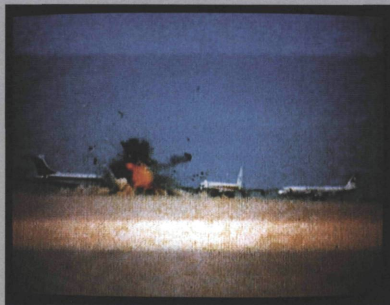
Johan Grimonperez, image tirée de DIAL H-I-S-T-O-R-Y , 1997.

Elitza Dulguerova est post-doctorante à Stanford University. Son livre Usages et utopies: l'exposition dans l'avant-garde russe préévolutionnaire paraîtra en 2009 aux Presses du réel.