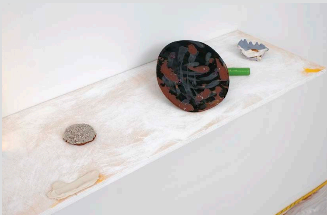
Derya Akay, Shelves (with mirror paintings and transparent blob with garden green) (2013), 81 x 208 x 30.5 cm.

Blobs are also closely linked to my relationship with food. Ceramics relates directly to both the kitchen and the garden, settings that have an influence and guide how I make things. I like to apply a fortuitous approach to food-making, allowing space for flavours to develop. Gardening is similar: allowing ‘volunteer’ (from the compost) plants to grow and giving (some) weeds a chance. By being imaginative, ruthless