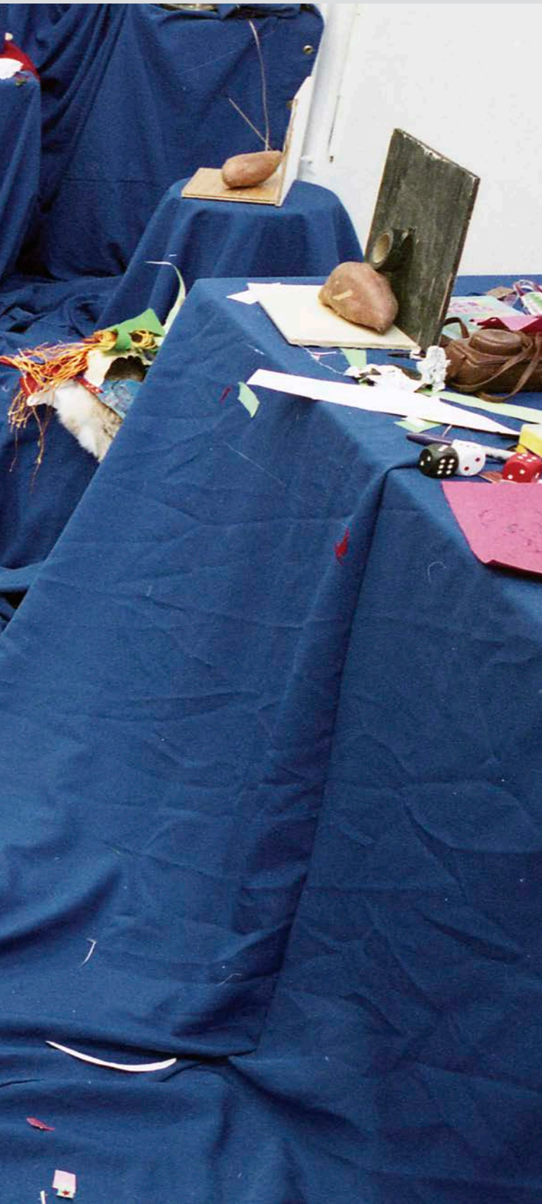
Derya Akay, Banff Blues (2010), 35 mm film.

Derya Akay: Banff Blues came out of a residency I was doing at the Banff Centre in 2010. On one of the first days, as we were taken on a tour around the Centre, I came across a blue chroma key curtain. I initially borrowed the curtain for a still life, but then realized how large it was and decided to cover the whole studio with it. So for the duration of my residency, the blue curtain became a background for every surface it covered and object placed on it. Its effects inspired me, the way it transformed objects that were displayed on it. It became an installation in retrospect, through its documentation. The studio was this large surface where the remains of an event or a party could be documented. I would spend hours going through the mess of the studio and re-think certain arrangements, photograph them, study them to create an archive of documentation. I have never shown this work in any kind of exhibition, and still don't actually know how to display it. It never quite existed as a sculpture, photograph or an installation.