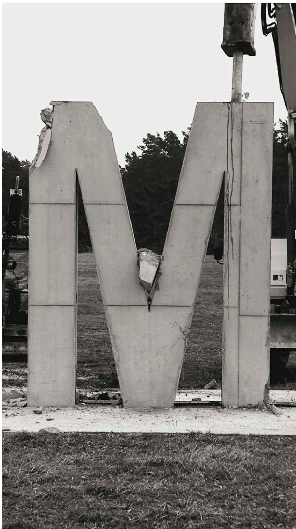
Santiago Sierra, Destroyed Word (details), October 2010-2012.