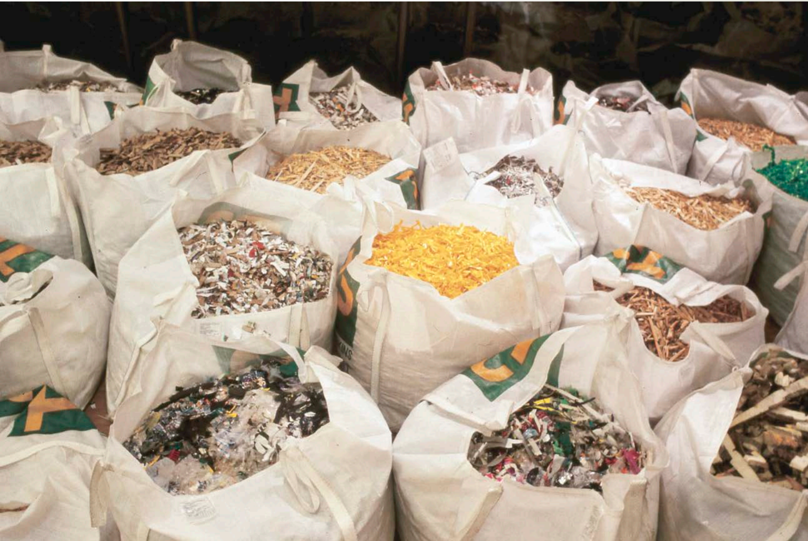
Michael Landy, Break Down, 2001. Installation view. An Artangel commission. Courtesy of the artist and Thomas Dane Gallery. © Michael Landy.