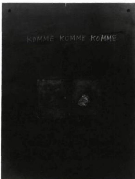
Betty Goodwin, Steel Notes (Komme Komme Komme) , 1988-89. Wax, pastel, ferrite, steel filings, steel on metal; 57 x 43 cm.

reliefs, they are no less adept at invoking the flesh and have an explicitly fetishistic aura; they remind us not only of the reliquary statues, the so-called nkisi nkonde (the fétiches à clous ) of the Congolese secret societies — with their nails wired close to the magnets, the tortuous tracks of filings resembling splintered teeth or folds of flesh, magnets like the stuffed reliquary in which the magical, life-enhancing medicines are close-packed — but also of grave markers specific to a technological space. More importantly, the reliefs allude to forsaken bodies; oppressed by space and ejaculated beyond time. Tablets of weathered surrogate flesh, they tremble between the wall and a hard place, and demonstrate that the body is never a tabula rasa but an elaborate inside and an outside upon which are inscribed all the significations and torments of time.