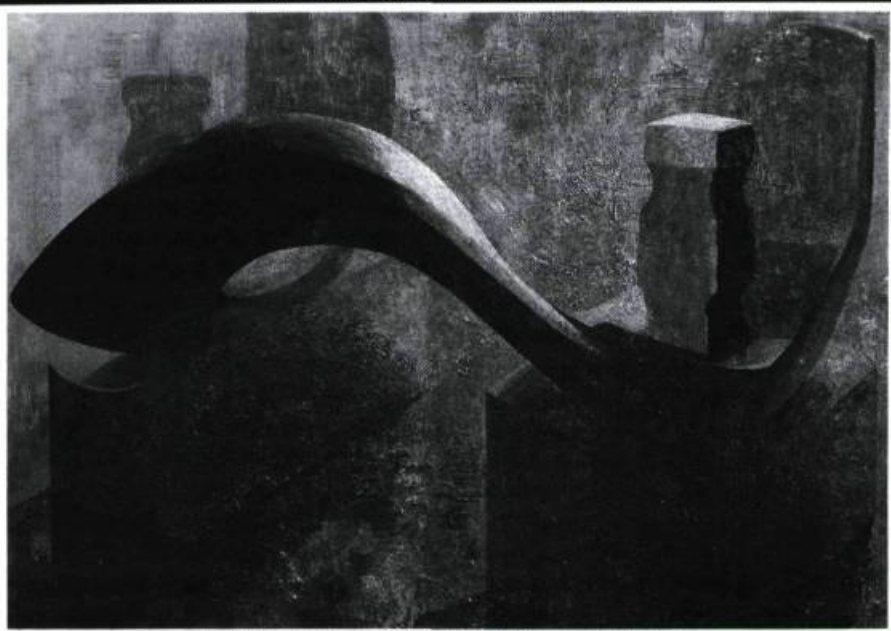
Loraine Simms, Duo-Conoylar Knee Prosthesis, 1992. Oil on canvas; 142 x 196 cm.

Parti Pris Peinture, Galerie de l'UQAM, Montreal. March 4 - 28, 1993 Le Cénacle, Belgo Building, Montreal. February 24 - March 20, 1993