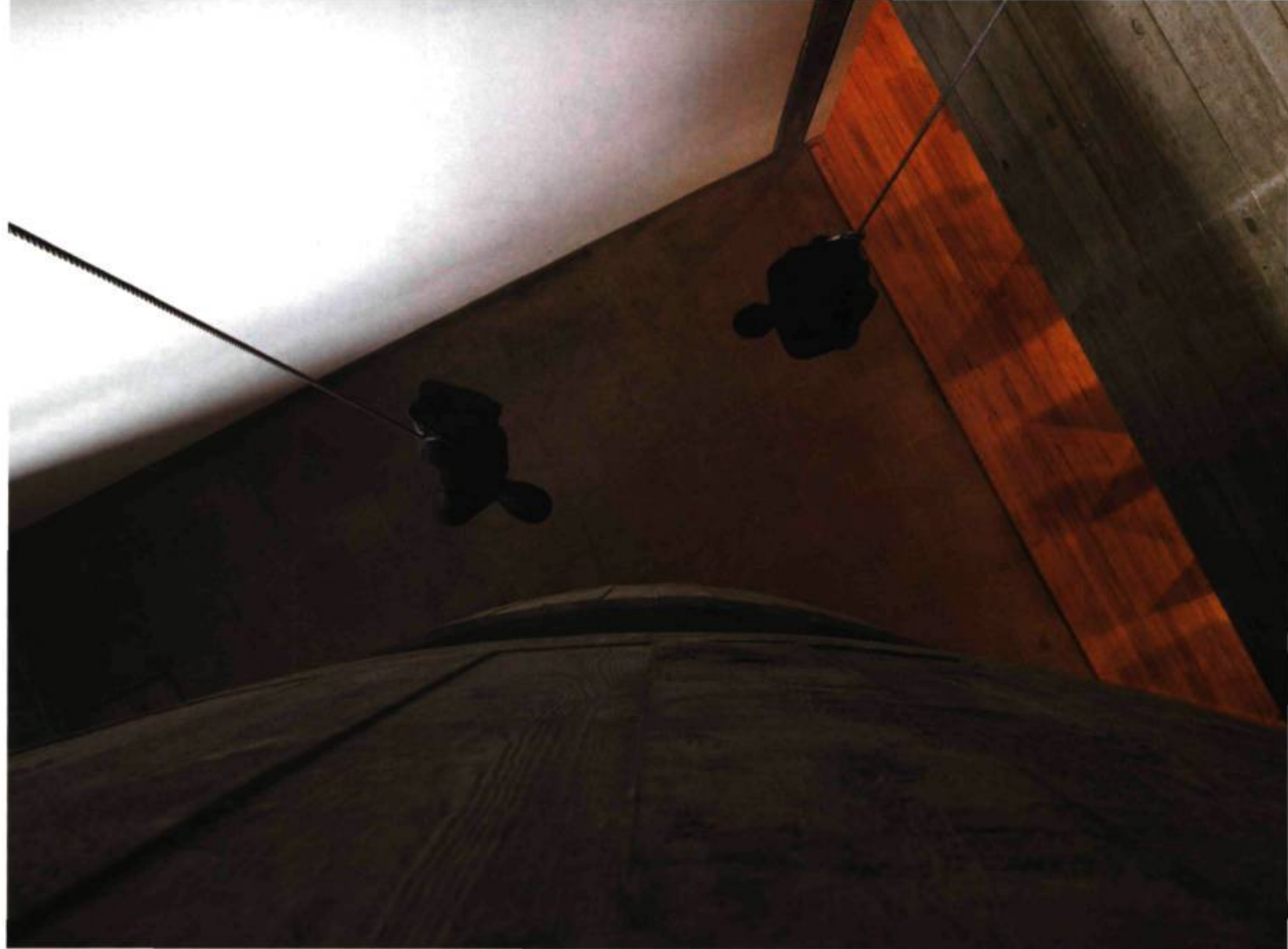
© Marina Abramović 1995-2000, Courtesy of the artist and Jay Jopling/White Cube, London