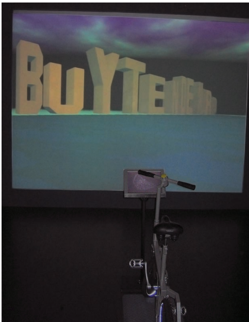
Jeffrey Shaw, The Legible City , 1990. Exhibition Digital Avantgarde/Prix Selection . Lentos Kunstmuseum Linz, 2004.