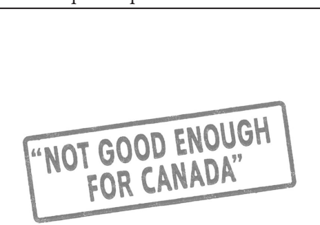
Canadian Public Discourse around Issues of Inadmissibility for Potential Immigrants with Diseases and/or Disabilities

course around immigrants, citizenship and disability/disease which have often been discussed separately (169) despite many previous scholars focusing on the economics (usefulness and productivity) of immigrants (28) and the exclusionary policies defining who is permitted to become a part of the state (who is on the right side of the Cold War, for example). None of the post-Second World War incremental changes in attitudes to persons with disabilities within Canada—pre- or post-Charter—and none