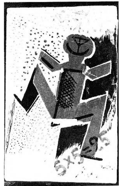
FIGURE 5. Varvara Spepanova (Costakis), Cover for 5" x 5" = 25" Exhibition Catalogue (Moscow, September 1921). Gouache and collage on paper. New York, The Guggenheim Museum.

terials in the Russian Avant-Garde,' and a study of the work by the Ukrainian artist Vasilii Ermilov by Valentine Marcadé.