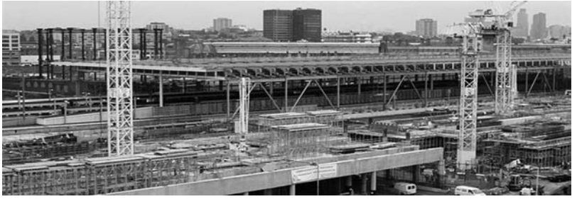
Figure 4. View of the King's Cross/St Pancras redevelopment project © Miramax, 2006.

Fainstein 2001, Frieden and Sagalyn 1989, Hannigan 1998, Milroy 2009). This contrasts quite starkly with the state-driven development of earlier projects like Alexandra Road Housing. The organisation in charge of the King's Cross project is a private development agency called the Argent Group. Its role is to generate and channel private investment capital to the restructuring of the areas between and immediately north of the two train stations. This is typical of the strategies employed by such firms which enable the development of mixed-use commercial, office and residential complexes. In principle, these are sensible and sustainable urban patterns: the different functions support each other and promote round-the-clock use of public space, which makes for safer streets and a healthy urban environment. Concordant with the shift to private development of these projects, rather than just social housing per se, the King's Cross redevelopment offers shared ownership, shared equity and a mix of intermediate-valued homes for sale and/or rent.