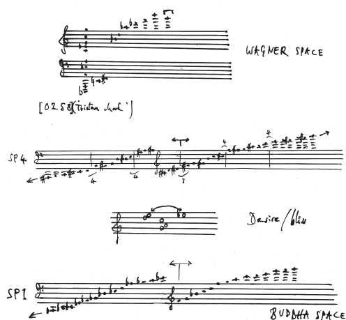
FIGURE 2. Harmonic spaces for Wagner and Buddha, conceived in August, 2003. (This document: February, 2007)

Shortly after, there is a low A played by a sampled trombone, set at a distance by the spatialiser; another, more distant, canal boat. This repeats at 35 second intervals, as opposed to the E flat's 25 second intervals. A sort of slow ostinato, background to the actors' entrance and dramatic encounter.