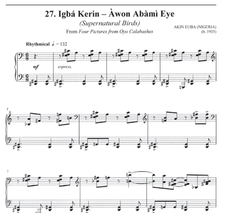
FIGURE 4 Akin Euba, "Igbá Kerin – Àwon Abàmi Eye (Supernatural Birds)" from Four Pictures from Oyo Calabashes, bars 1-9 (Nyaho, 2009, p. 73)

of hymn singing, thanks to its simple tunes, modest tonal trajectories and regular phraseology, not to mention textual messages laden with assurances and promises of a better life after death. And yet there are indications that some composers are willing either to leave their communities of origin behind, or establish a different set of terms on which they relate to their brethren. If we must compare, we might say that the contents of Piano Music of Africa and the African Diaspora seem generally tame when compared with avant-garde works by Cage, Boulez, Stockhausen or Lachenmann. But the consistently dissonant ambience of Euba's 'Igbá Kerin-Àwon Abàmi Eye' (Supernatural Birds) (Figure 4) and 'Igbá Kìnní-Akèrègbè Baba Emu' (The Gourd Master of the Palm Wine), the rhythmical play and expanded instrumental resources required to perform Ali Osman's 'Afro Arab Blues' (the performer is enjoined to "say 'es' and snap [his or her] fingers" throughout) (Figure 5), the discontinuities, improvisatory freedom and occasional stillness cultivated in Bongani Ndodana-Breen's 'Flowers in Sand,' and the rhythmic drive and superimposed chords that animate Gyimah Labi's 'The Lotus' (Figure 6) suggest that it may not be too long before the two traditions become indistinguishable.