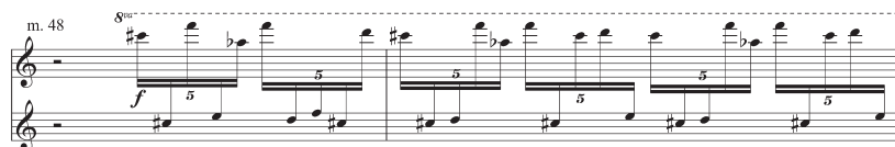
FIGURE 4 Géométrie sentimentale , i, mm. 48-49 (piano).

Finally, the fast, jerky and aggressive red robot arrives in measure 59 in the winds, characterized by a steady eighth-note triplet rhythm in the upper register and a slower, sometimes syncopated accompaniment in the lower instruments. Its aggression sometimes gets the best of it, causing steam to burst out of its head; this is illustrated musically by the sudden crescendi leading to accented chords (see Figure 5).