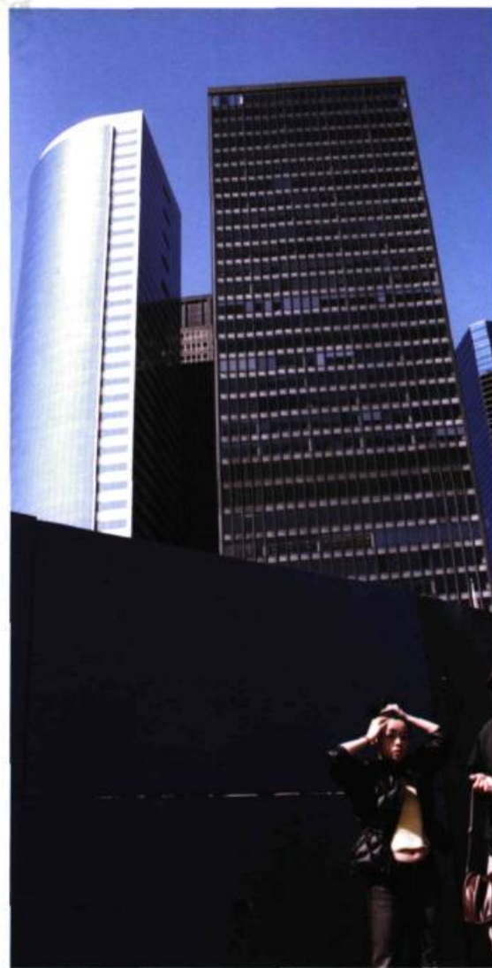
Part 15, 2003