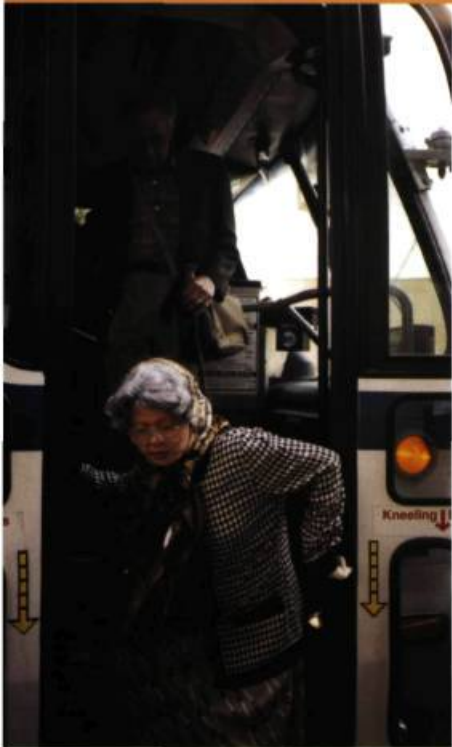
The Senior Project (14) 1999