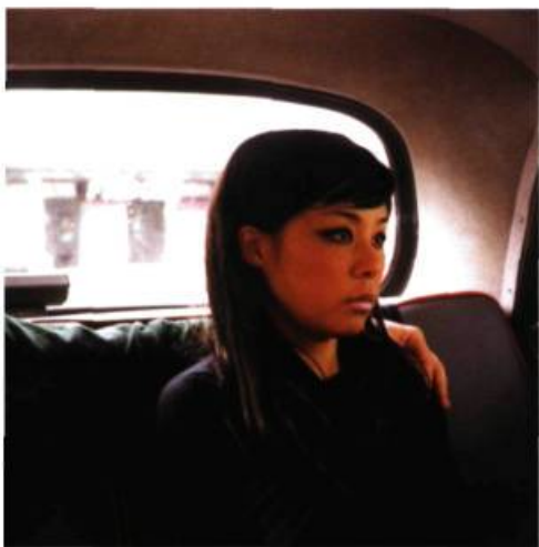
Part 10, 2003 Part 14, 2002

have experienced both roles at some time or another. Parts , Lee's latest series, continues to explore this language of the snapshot and its dependency on narrative. She adds another layer of interpretation and places an importance on the reading of the images by removing sections of them – people, buildings, skylines. Parts are missing from each image, leaving us to wonder about their absence and the significance of that absence. Lee uses the white border typical of snapshot processing to indicate that the image is incomplete. This border allows the images' content to seep out into a gaping space, where we project and fill in the missing pieces.