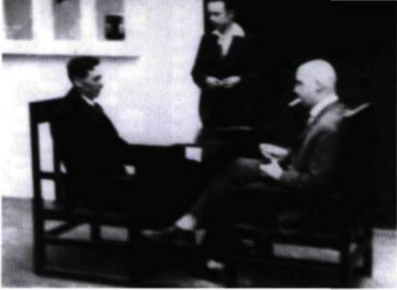
Aleksandr Rodchenko jouant aux échecs dans le coin Lénine de son club ouvrier.