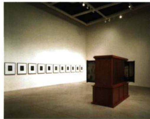
Sententia I – LXII, 1998

meuble d'archives photographiques bois de cerisier et bois laqué (cadres/tiroirs)