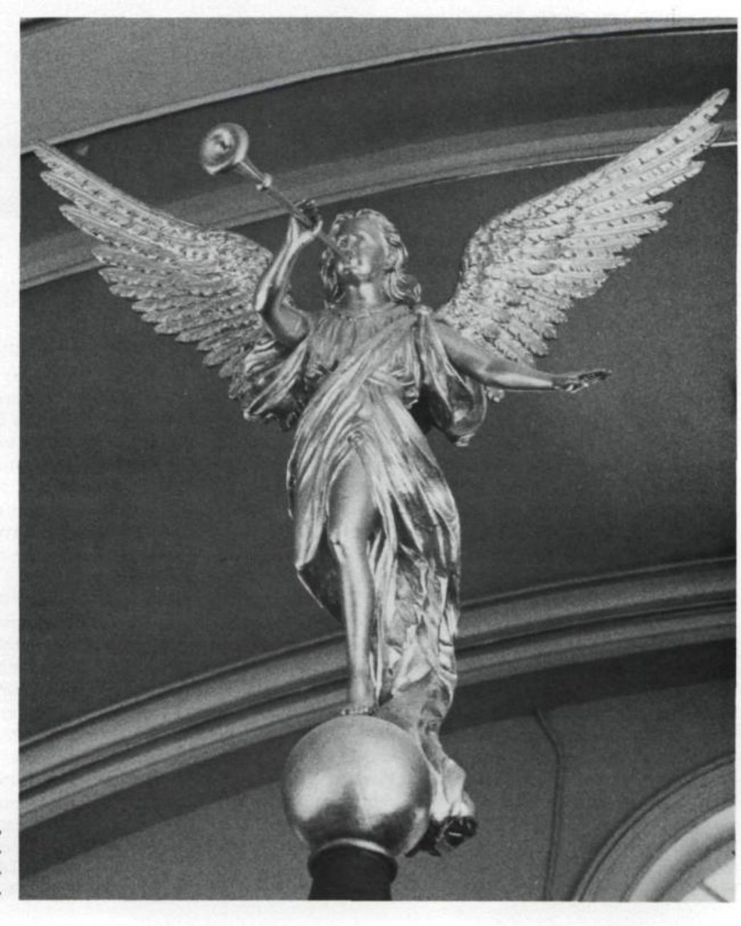
Louis Jobin, Ange à la trompette, c.1902. Wood, 152 cm. Coll.: Saint-Calixte, Plessisville, Qc.