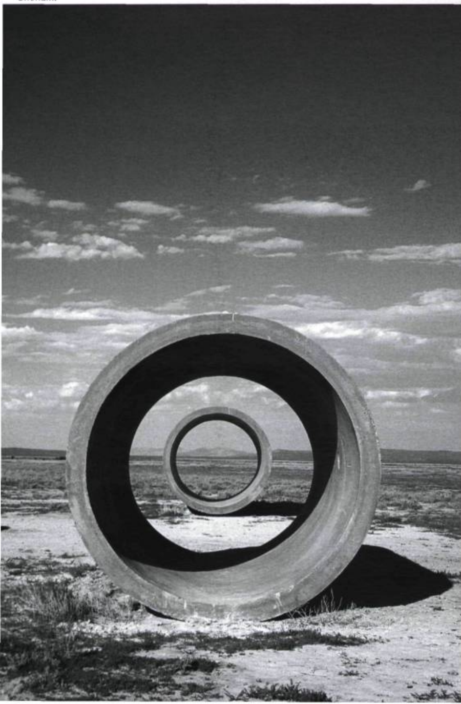
Nancy Holt, Sun Tunnels . Summer solstice sunrise, June 21, 1997.