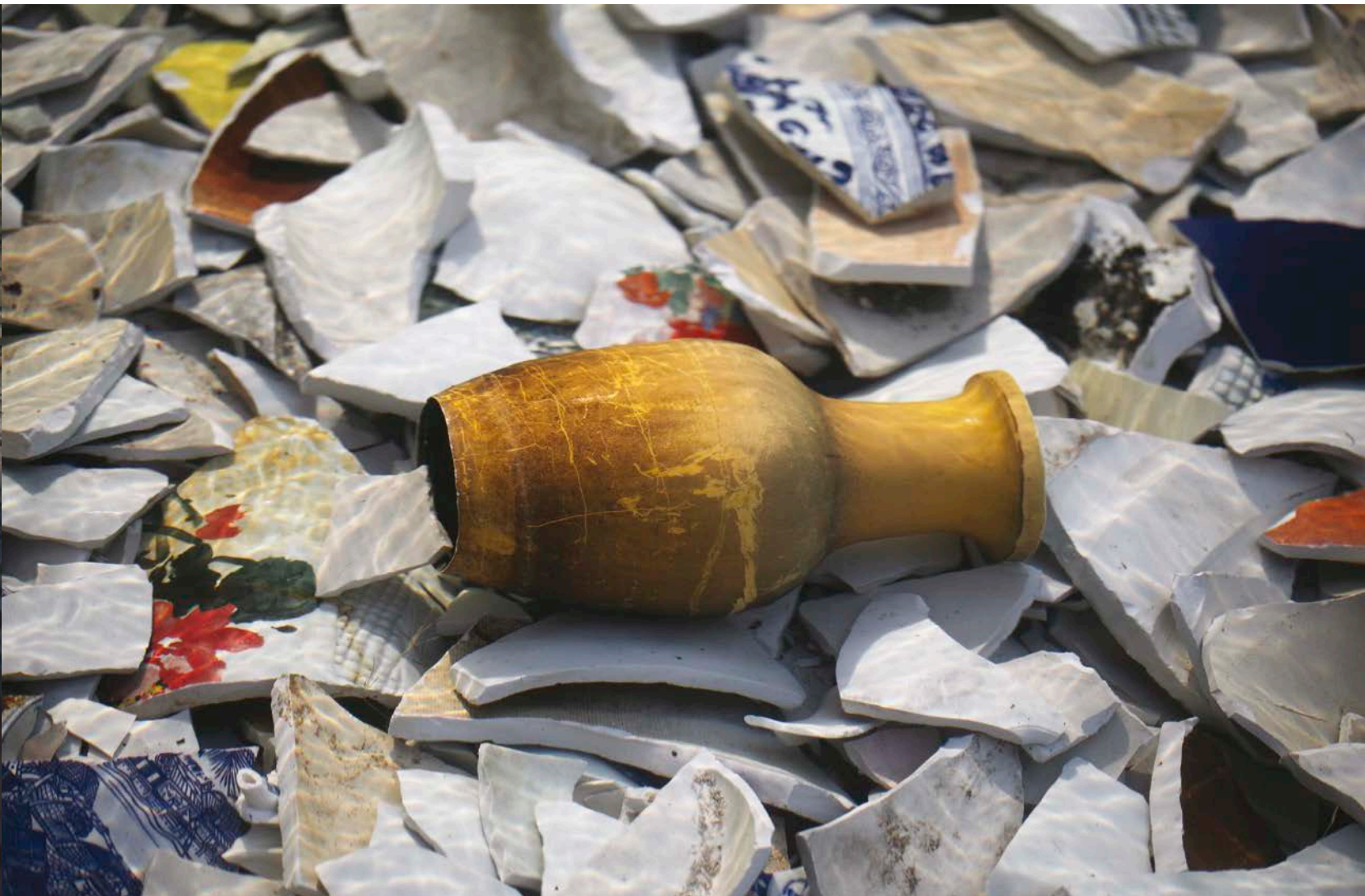
Liu Jianhua, Discard (details), 2011. Sino-Italia Design Exchange Centre, Shanghai, installation of broken reproductions of historical porcelain vessels, variable dimensions.

Han Dynasty Urn and Souvenir , Ai shatters our idealised abstractions of history by exposing the traces of the past within the present, both aïdes-mémoires and catalysts for change. In his many variations of Regular-Fragile , Liu blurs past, present and future, drawing a forceful comparison between the capitalist rhetoric of progress and the inevitable fact that even the highest ambitions will one day be forgotten and discarded. The final word on the subject, however, falls to Dust to Dust and its reference to the regenerative potential of destruction as harbinger of a new era, in which humanity may or may not play a role, depending on the choices we make now to accelerate or temper our consumption of the world's resources.