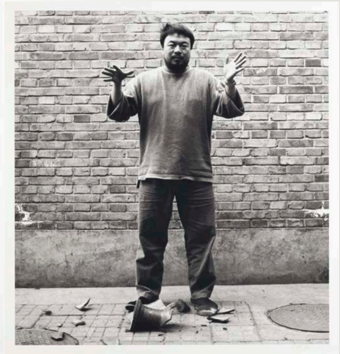
Ai Weiwei , Dropping a Han Dynasty Urn , 1995. Gelatin silver photograph. Three sheets: 180 x 169.5 cm (each). Purchased 2006. The Queensland Government's Gallery of Modern Art Acquisitions Fund. Collection: Queensland Art Gallery | Gallery of Modern Art. © Ai Weiwei.

Ceramics are an ideal case study in the aesthetics of destruction. While a ceramic object can be preserved for centuries, it is always haunted by the chance that it might slip from unsteady hands or fall from an exposed shelf. The conceptual resonance of this fragility has long been esteemed in China—a nation so closely tied with ceramics that country and material are synonymous in the Anglophone imagination—and many Chinese artists have adopted ceramics to reveal the destruction inherent to contemporary society. Ai Weiwei and Liu Jianhua are among the most renowned proponents of this aesthetic. From the 1990s to the present, both have used ceramics to expose acts of violence that far exceed a simple smashing of vases, ranging from planned obsolescence, environmental degradation and ecological cycles of decay and renewal, to the redemptive power of destruction as a crucible for regeneration.