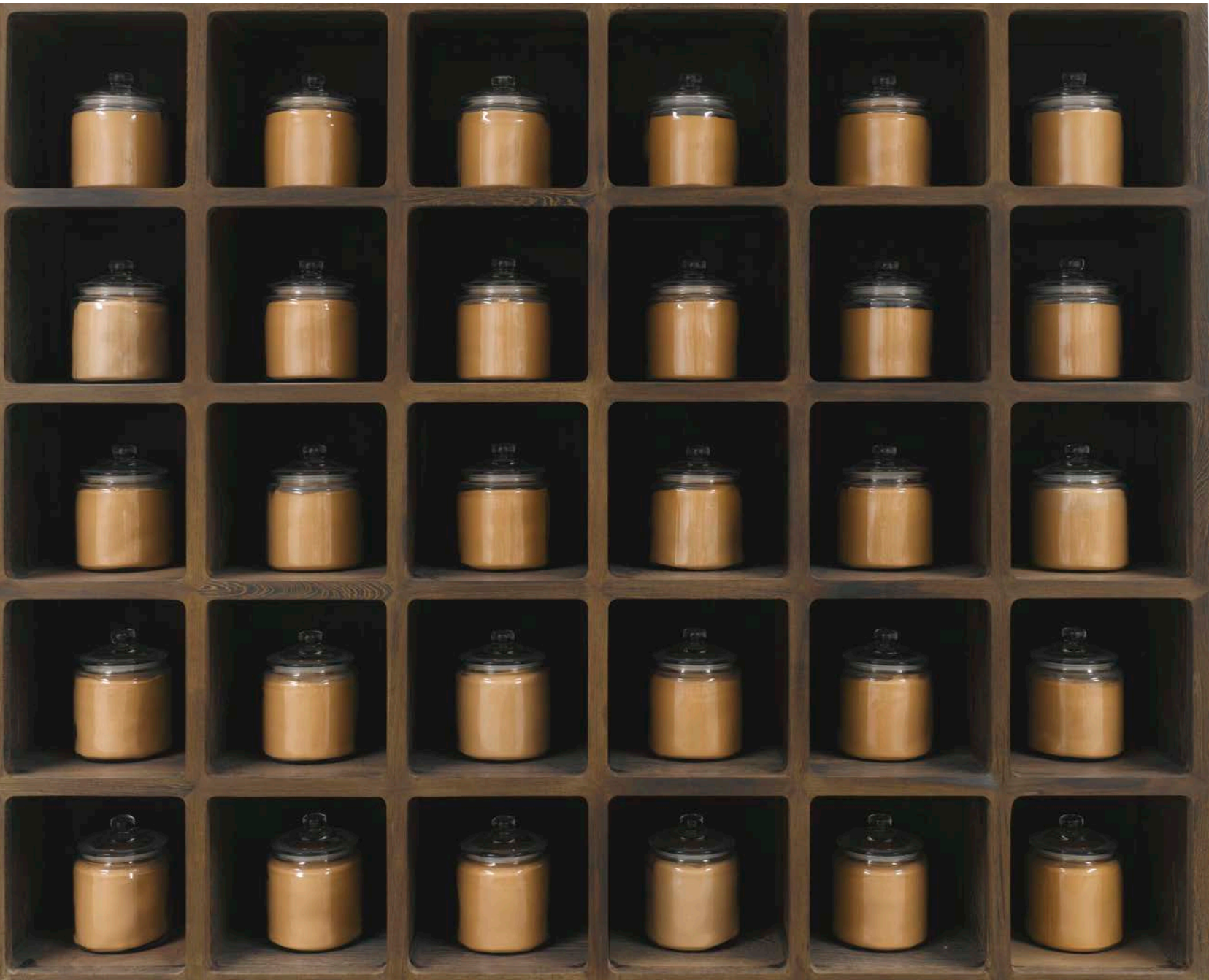
Ai Weiwei, Dust to Dust, 2008. Powder from grinded Neolithic pottery (5000 - 3000 BC), glass, and wood, 200 x 240 x 36 cm.