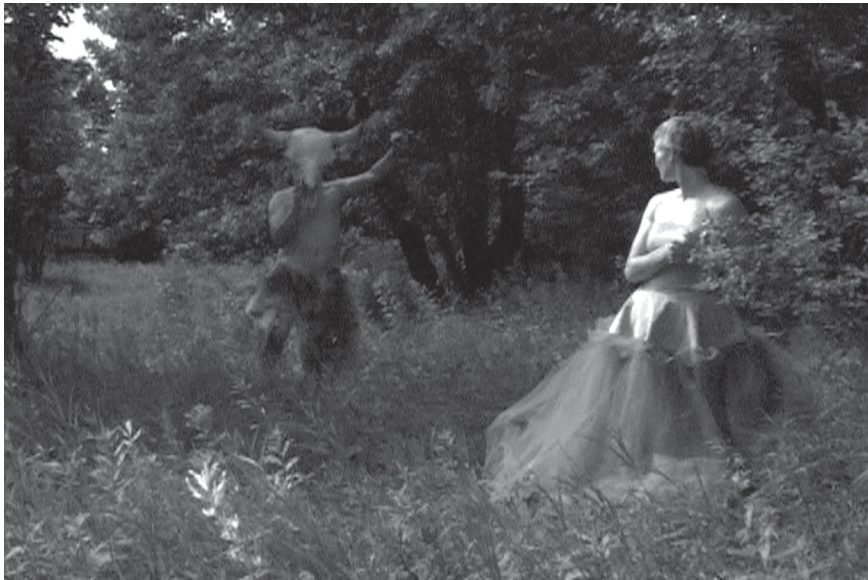
9. The Shadow revealed in direct confrontation.

Suddenly, the music changes and the entire screen darkens with the shadow of the minotaur once again. This time, however, it is not a static shot as it is at the beginning, but a moving one. The shadow becomes larger and larger as the minotaur moves closer and the viewer sees just a bit of a body cloaked in animal skin. But it is enough to shift the scene. What was a shadowy premonition at the opening of the piece has turned into reality. Its relation to the woman at this point is unknown, and since the image of the minotaur is mythic, only partially visible and ambiguous, its presence is dramatic and unsettling.