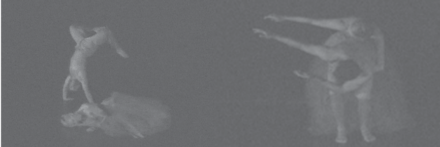
2. The animus appears in darkness.

The two eventually move to a standing position with the female behind the male. She bends over him, holding her arms around him as if she is sheltering him with her wings. She does not make physical contact with him, but their arms move in unison. As the woman steps out of the scene, the male sinks back to the floor, opens his arms wide to express the purity of his intentions and then curls up into a tight prayer posture, returning to the earth. His eyes are shut and his hands cover his face.