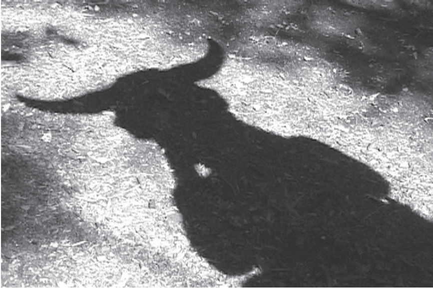
1. The shadow appears.