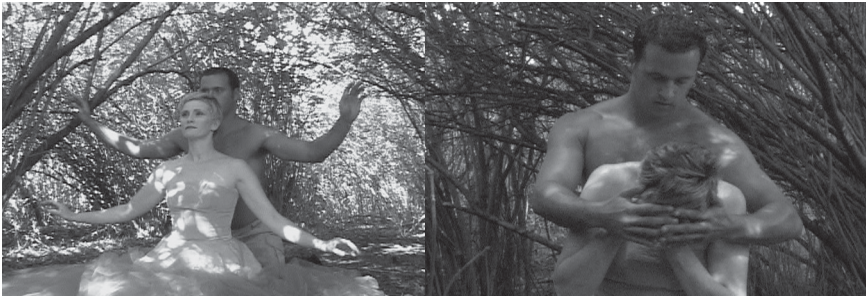
7. Inside the copse

From there they begin to move their arms in unison from side to side like coral in the waves. Their wavelike gestures give the appearance of a patterned union and replicate the arches of the surrounding trees. The woman's hands never touch her own body, but her partner's hands move closer to her. The couple rise, the male standing behind the female, and they repeat the sequence. She drops her head, covers her eyes and slowly moves her head from side to side, imitating the earlier gesture of the male. It is as if she is disturbed and trying to hide from the awakening, which by its very nature is painful. The male recognizes her sorrow and empathizes with her, as he places his hands on hers and moves with her as she rolls her head.