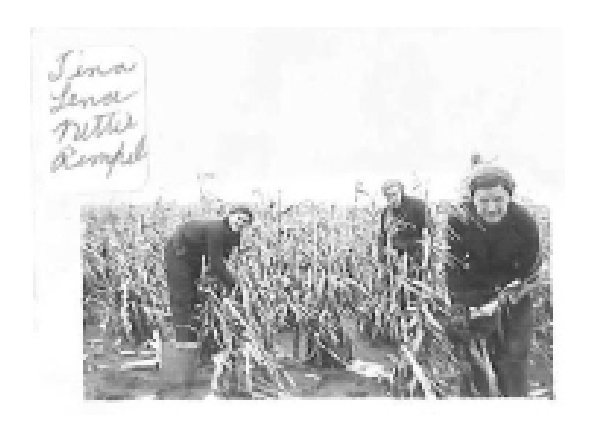
Figure 13 - Brommtopp Troupe from Amsterdam District near Rosenfeld, Manitoba, circa 1928.