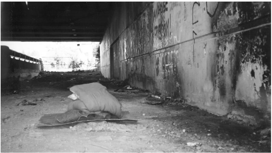
Figures 5 and 6. Under the bridge.

populations since it did not overlap with the housed public's use. 4 Various "in-fill" condominium projects have dramatically changed the area surrounding the shanty but at the time of this research the transformation in land use was only beginning, with three condominiums built beside the large sports arena that dominated the area south of the tracks. In fact, the construction area surrounding the development provided useful building