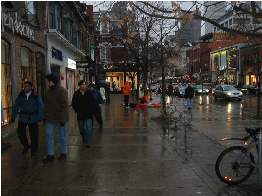
Figure 3. Queen Street.

In order to lessen the socio-spatial violation that panning appears to cause, street kids are adept at exploiting the interstices within normative socio-spatial order; specifically they exploit marginal microsites embedded along the streetscape itself to construct panning spots. Along the two blocks of Queen Street that made up my participant's primary panning scene, there were five prime areas (one available after five o'clock) and two or three less desirable locations. A good panning site is in a high pedestrian traffic area, slightly recessed from the street itself and allows room for a backpack and at least one other person. Most importantly these