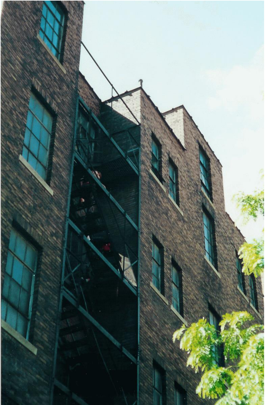
Figure 2. Fire escape.