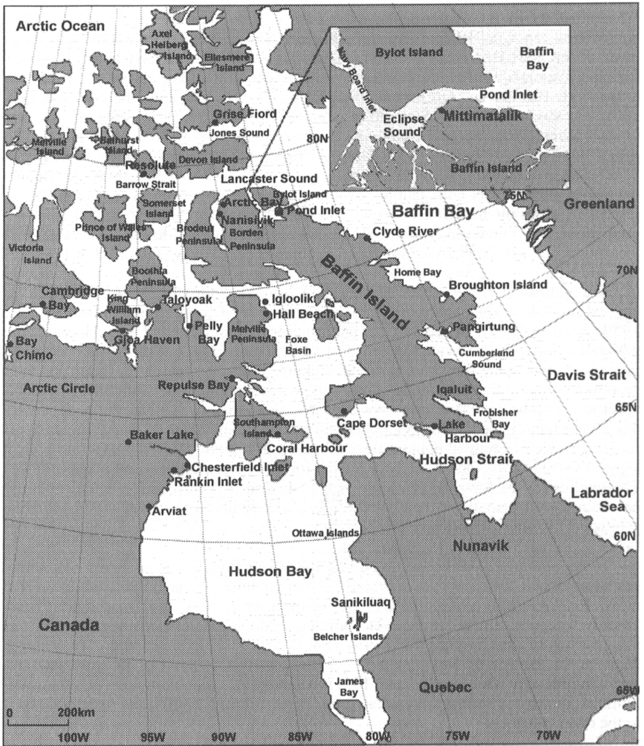
Figure 1. Location of Pond Inlet (Mittimatalik) and study area.