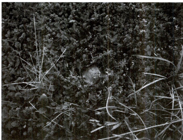
Figure 6. The Leccinum variety known in Chukotka as gornyi grib , literary ‘mountain mushroom,’ is highly prized, but finding it can be tricky. The challenge is trying to discern the orange-brown caps among the patches of Arctous erythricarpa , whose leaves turn merlot-red right around the mushrooms fruiting season, and even then the deceptive target may turn out to be a rock.