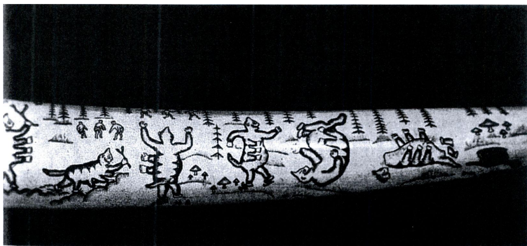
Figure 4. "The Story of Kele," a walrus tusk engraving by Kmeimit (from Mitlyanskaya 1976).