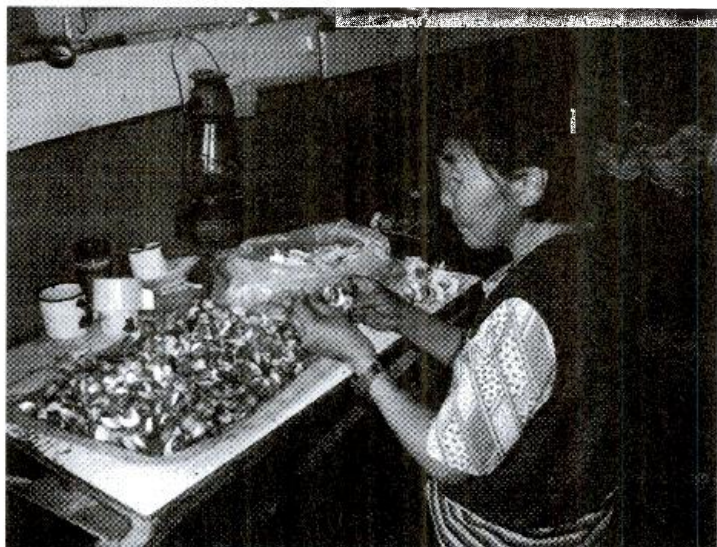
Figure 1. Stringing mushrooms in preparation for drying.