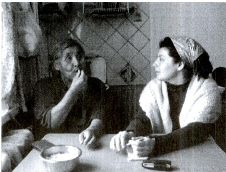
Figure 2. A Sireniki elder explaining to the author the practice of blowing air at one's hand in order to avoid contamination that mushrooms were believed to cause.