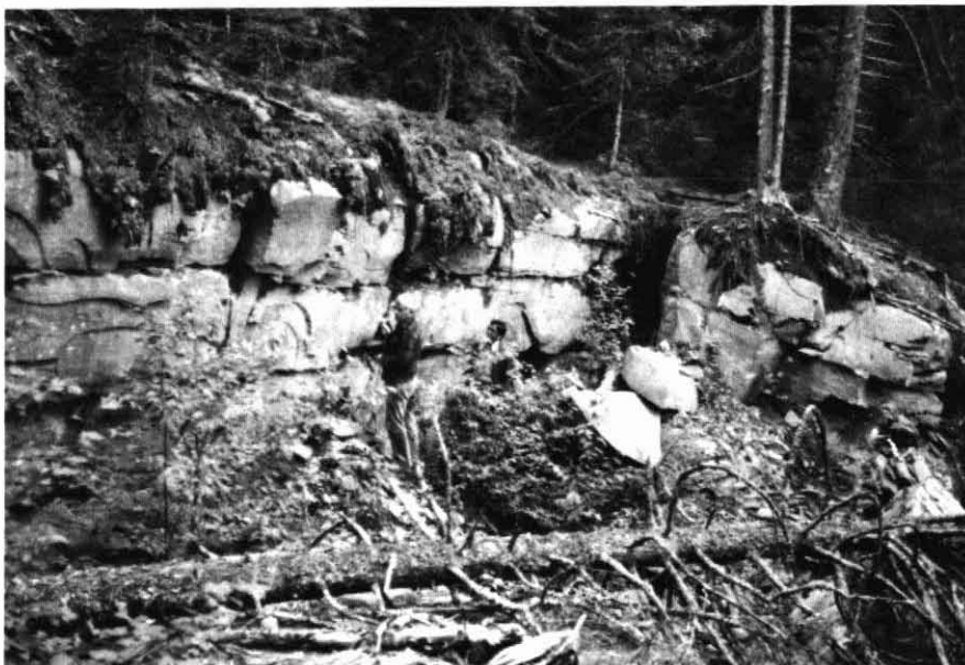
Figure 4 Effects of gravity sliding along parting surfaces (parallel to bedding) and offsets across joints, in Boss Point Formation.