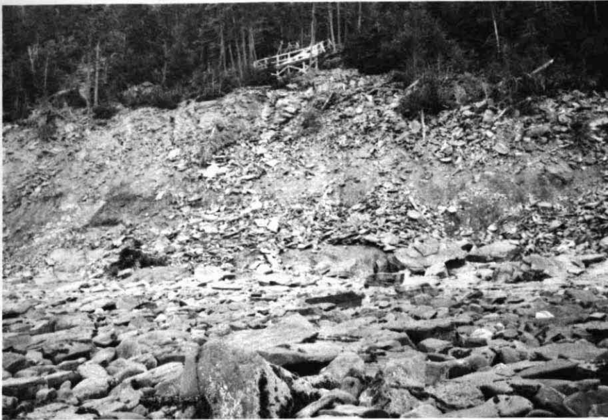
Figure 3 Gravity slide along purplish red shale member of Maringouin Formation, severely affected by marine erosion. The recently constructed wooden walk-way has in part been pulled apart as a result of sliding towards the bay.