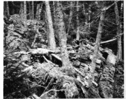
Figure 5 Effects of gravity sliding on vegetation.