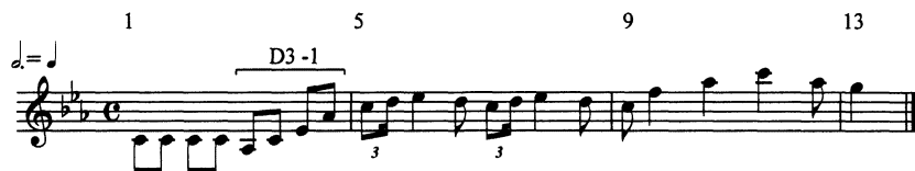
Example 16a. Durational reduction of the upper line in bars 1–13