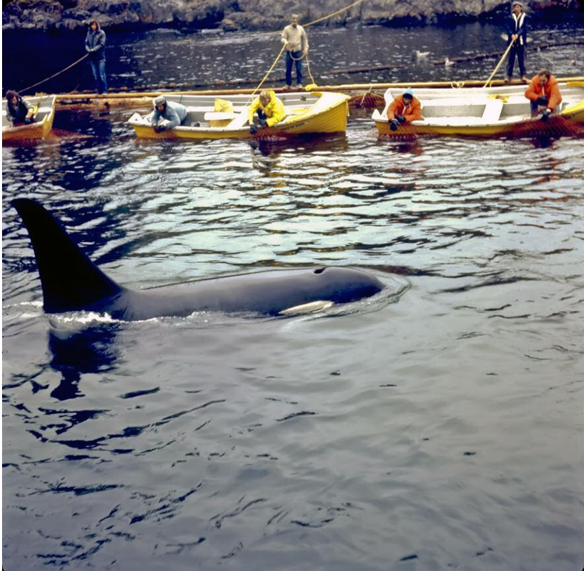
Captured orca in Pedder Bay, 1973.