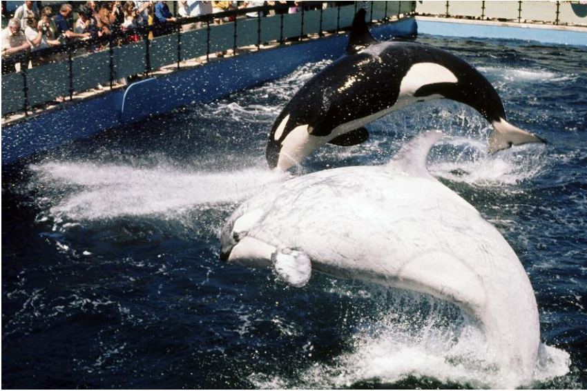
'Haida' and 'Chimo' performing at Sealand of the Pacific, Victoria, B.C., 1972.