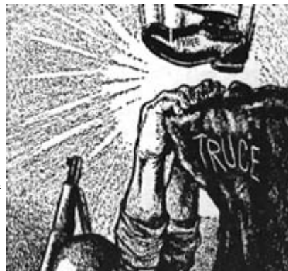
Figure 9 Resistance on the Last Ridge Don Hesse, St. Louis Globe-Democrat

By mid-1953, when peace talks were finally coming to fruition, South Korean President Syngman Rhee was often depicted as the major obstacle to achieving results. He adamantly was opposed to accepting any plan that did not reunify Korea and actually worked to undo the armistice on the eve of final agreements. 31 In Figure 9, "Resistance on the Last Ridge," Rhee's interference was characterized as significant enough to destroy the entire truce. 32